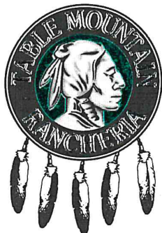
TABLE MOUNTAIN RANCHERIA TRIBAL GOVERNMENT OFFICE