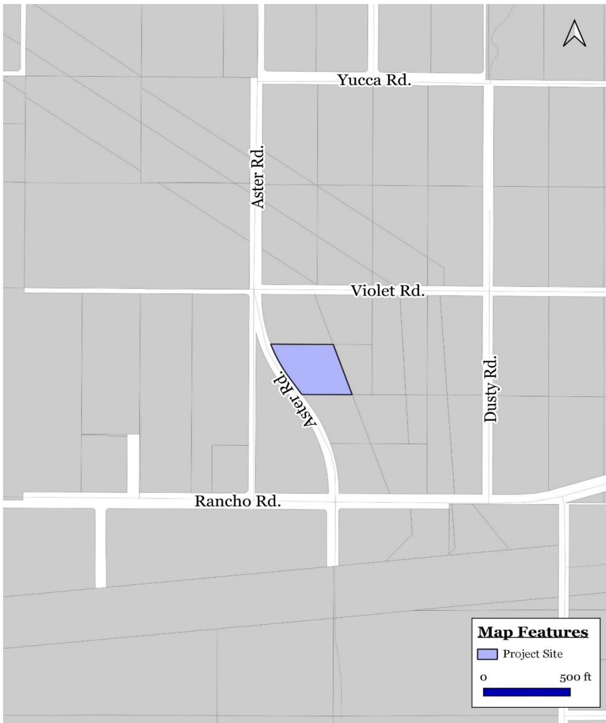
Figure 2: Project Site Location