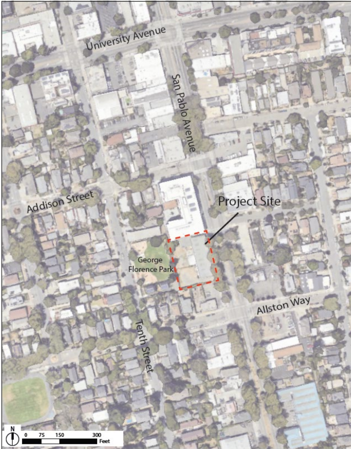
Figure 1 Project Location 2136-2154 San Pablo Avenue