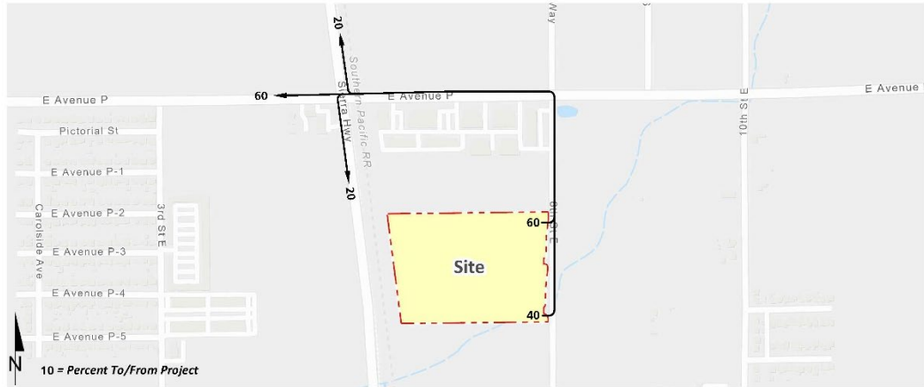
EXHIBIT 3: PROJECT (PASSENGER CAR) TRIP DISTRIBUTION