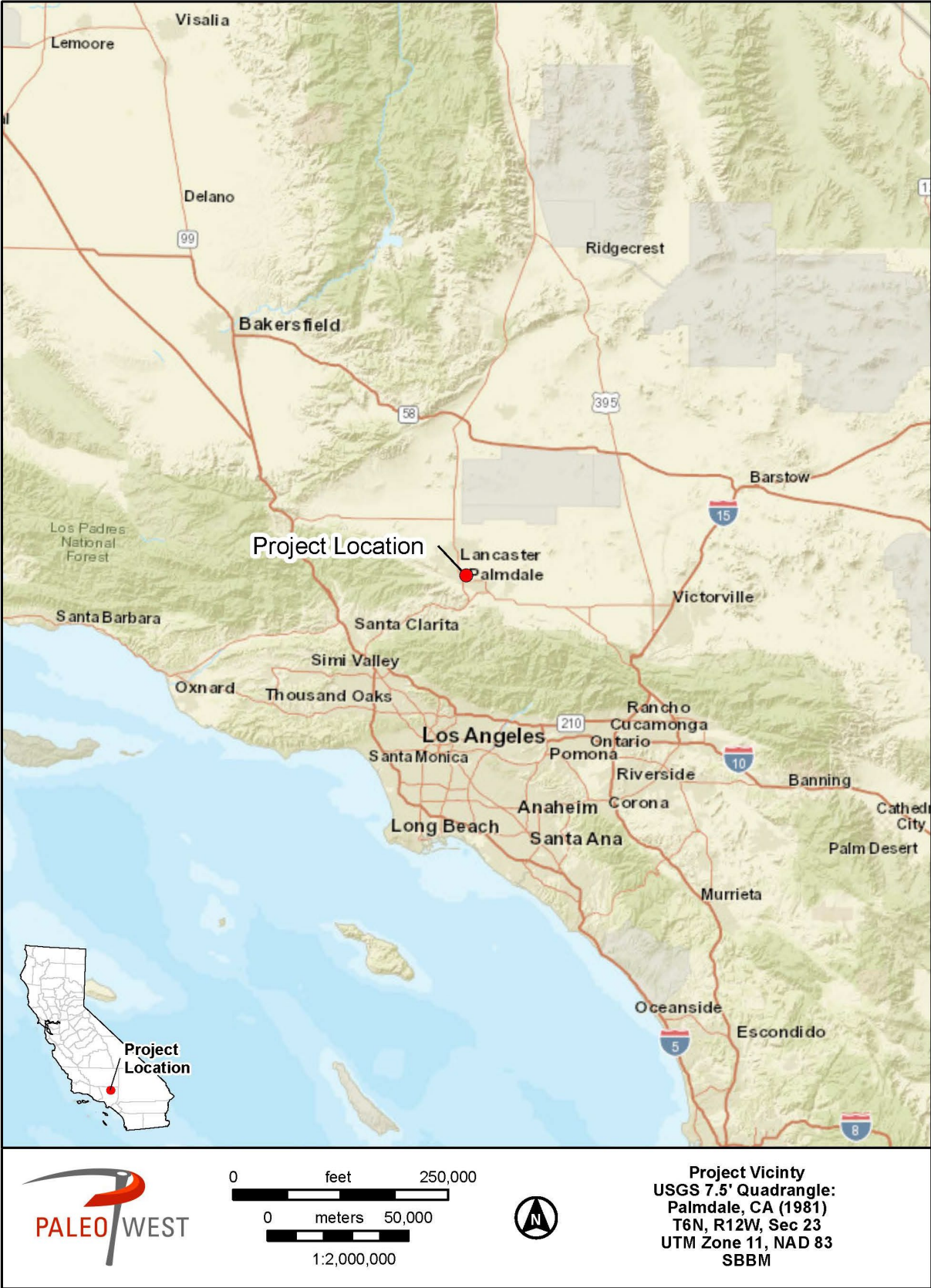
Figure 1: Project vicinity map.