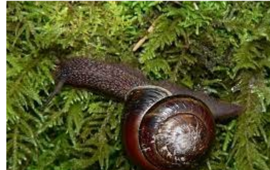
Figure - Monadenia circumcarinata (keeled)