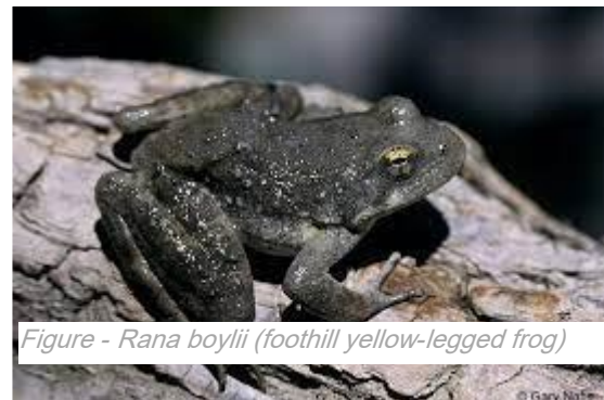
Figure - Rana boyllii (foothill yellow-legged frog)

b. Mapped to provided coordinates. Between Tuolumne River mile 80 and 81.