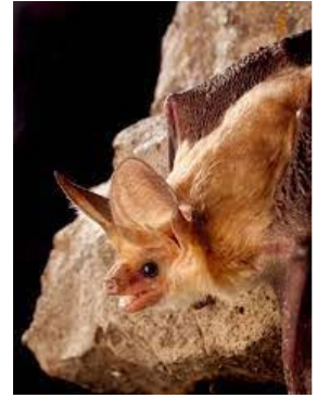
Figure - Antrozous pallidus (pallid

Mitigation/ Protection: If any are found during the project, operations will stop until full extent can be surveyed and proper mitigations can be enabled.