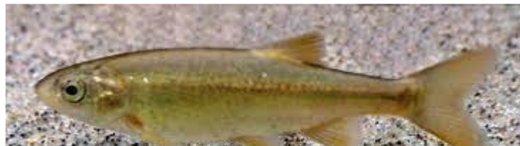
Figure - Hesperoleucus symmetricus symmetricus (central California)