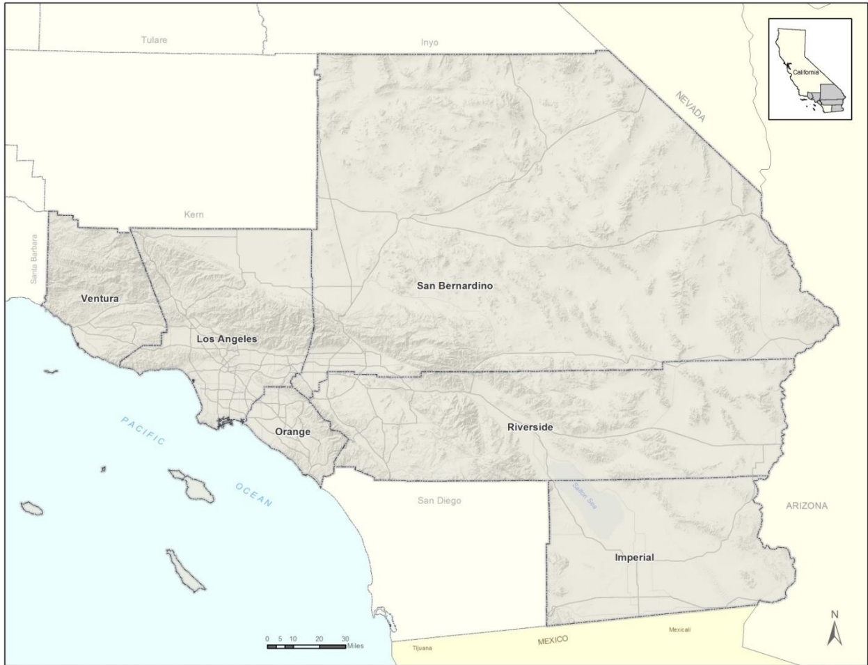
Figure 1: SCAG Region

SCAG is one of 18 MPOs in the State of California. The total area of the SCAG region is approximately 38,000 square miles. The region includes the county with the largest land area in the nation, San Bernardino County, as well as the county with the highest population in the nation, Los Angeles County. The SCAG region is home to approximately 18.8 million people, or 48 percent of California’s population, according to the 2020 Census, representing the largest and most diverse region in the country.