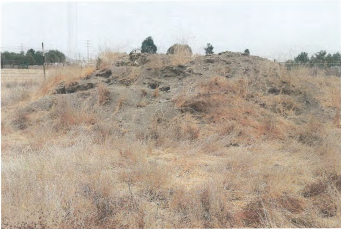
Figure 7. Photograph of a large pile of soil with included refuse - riddled with ground squirrel burrows. This is the most northern of three such piles on this centrally located parcel on the project site. Elevated burrows on slopes, road cuts, and piles of soil offer potential Burrowing Owl an excellent vantage over the surrounding landscape.