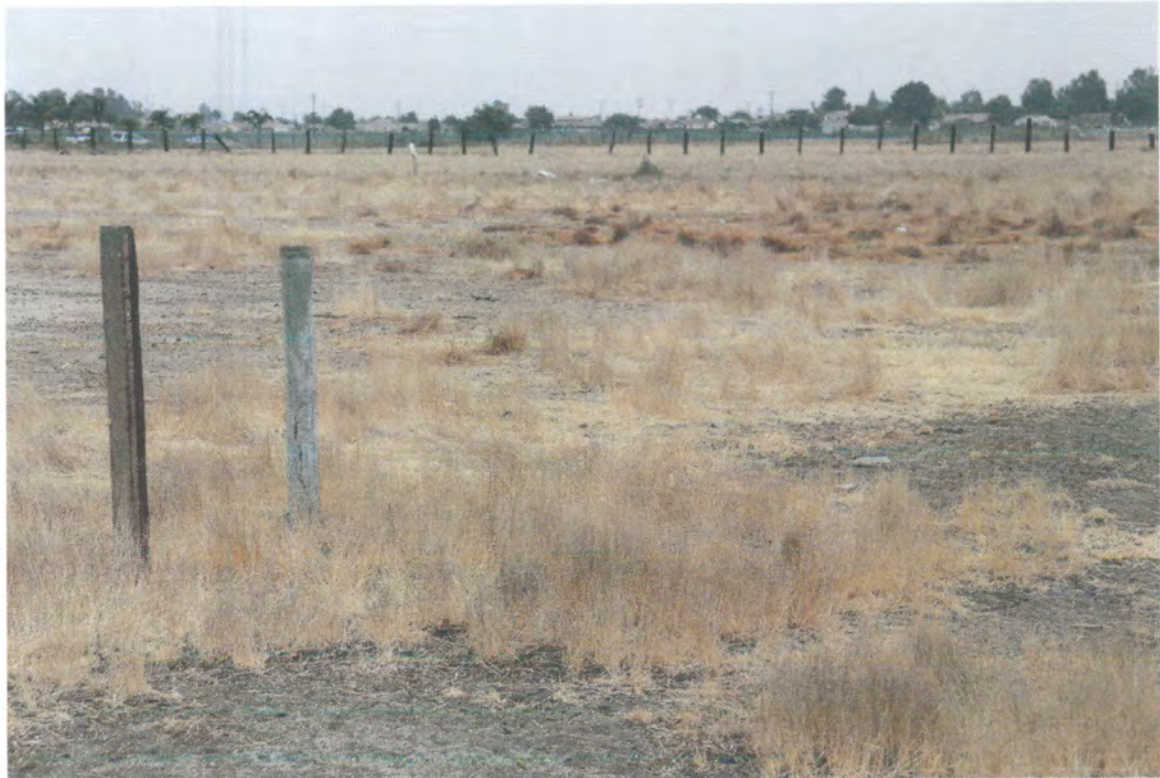
Figure 6. Photograph of the view across open land north of the project site (also surveyed for this study), looking southeast to the project area. Note the open grassland habitat over these adjacent lands as well as on the project site.