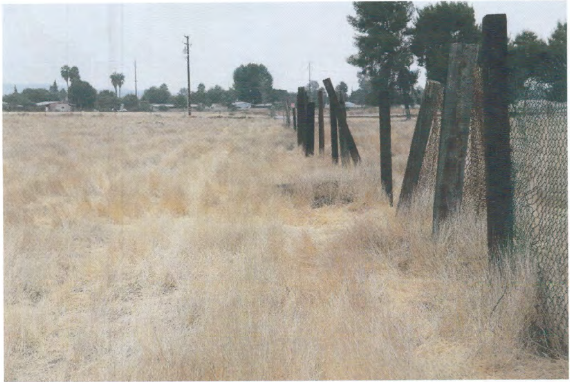
Figure 5. Photograph of view along the northern boundary of the project site as seen looking west along a dilapidated fence of rail ties. Ground squirrel burrows along such fence lines and similar structures are often used by Burrowing Owl. Open land to the north was also surveyed.