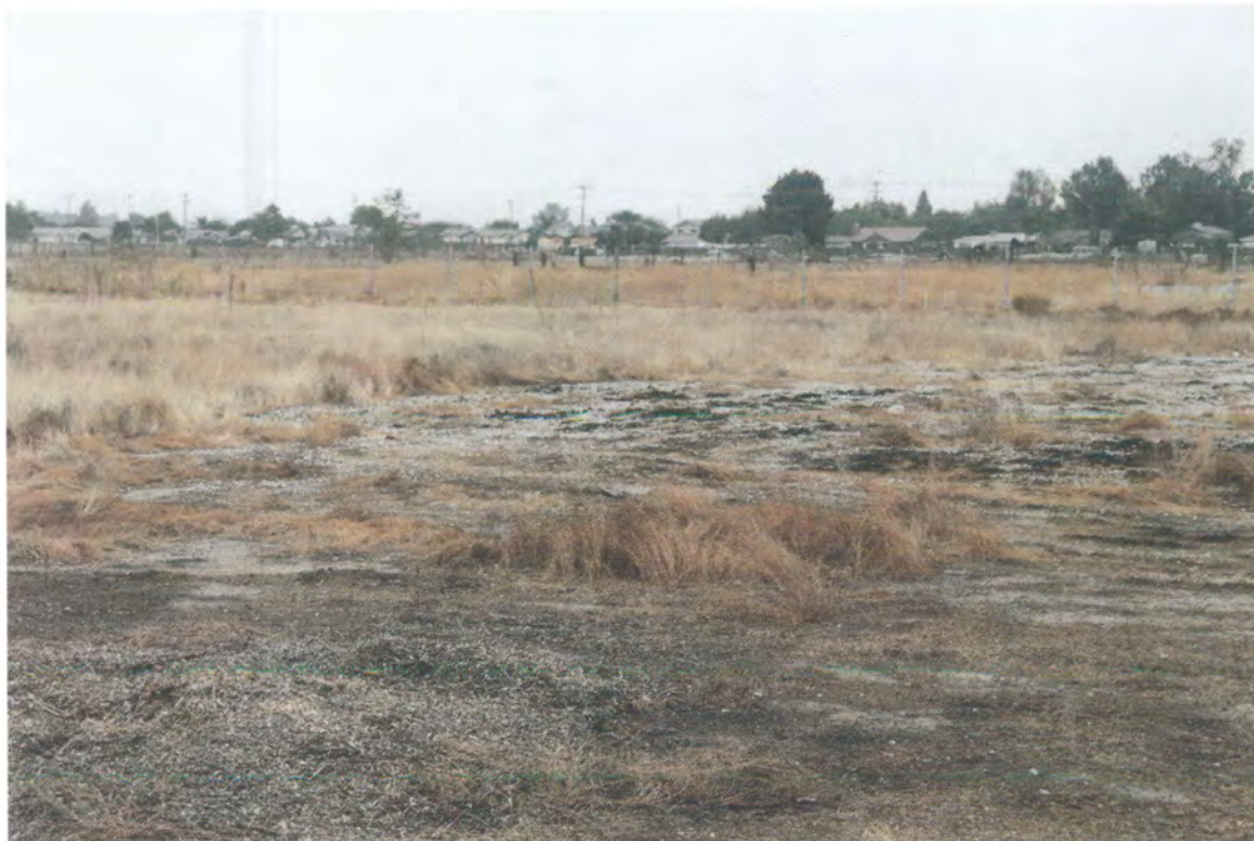
Figure 4. Photograph of the view across the study site, looking southeast from a central western portion of the project site.