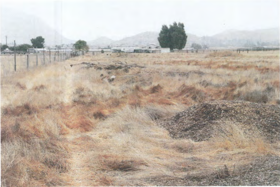
Figure 3. Photograph of central portion of the project site used for equipment storage. View is looking east from a central western edge of the project site. Here, vegetation is dominated by stink-net and brome grasses.