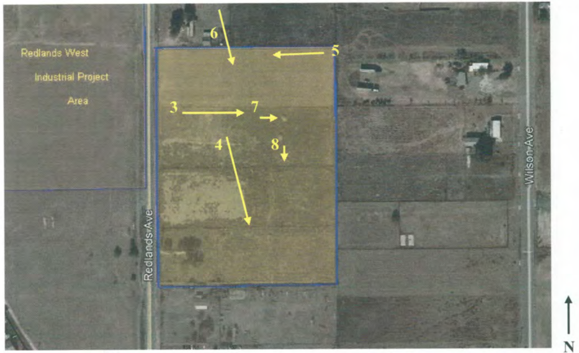
Figure 9. Approximate locations around project site from which photographs were taken (base of arrows). Arrow indicates the direction a photograph was taken. Numbers next to the arrows indicate figure numbers (Figures 3-8).