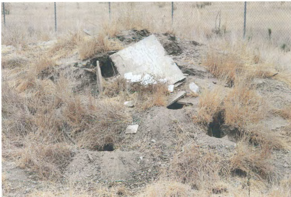
Figure 8. Photograph of a large pile of soil with included refuse - riddled with ground squirrel burrows. This is the most southern of three such piles on this centrally located parcel on the project site. Elevated burrows on slopes, road cuts, and piles of soil offer potential Burrowing Owl an excellent vantage over the surrounding landscape.