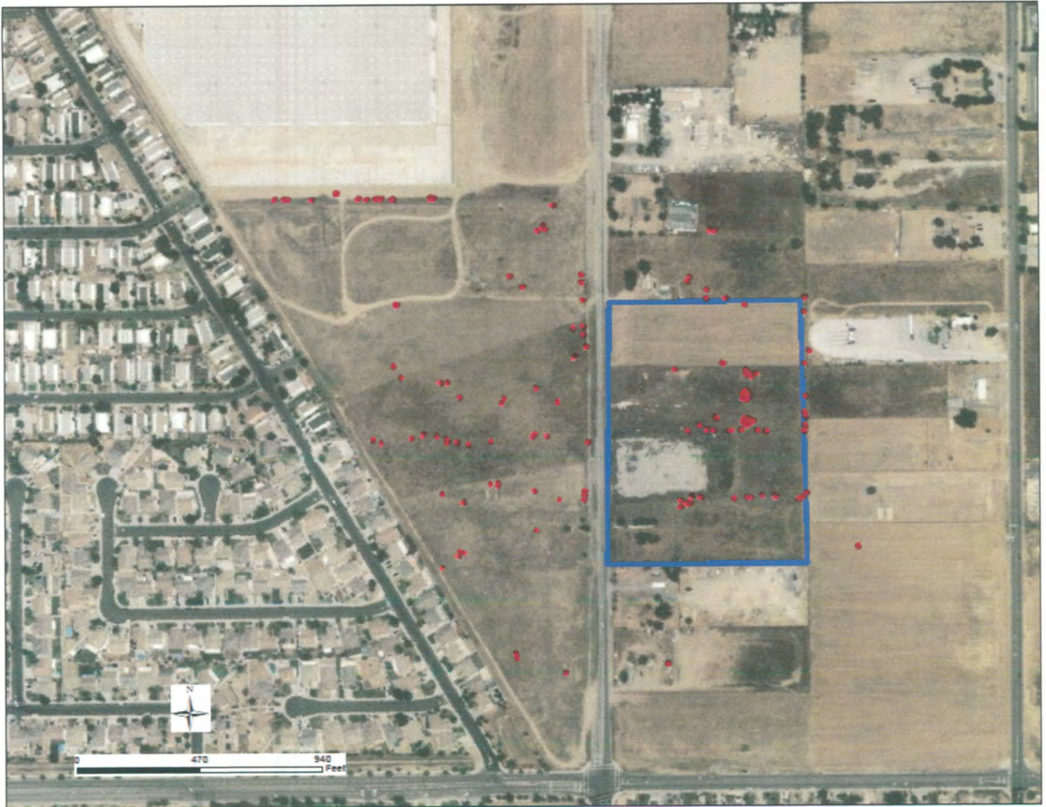
Figure 11. Distribution of burrows (red dots) on and around the project site (blue line boundary). Survey included lands southeast, south, southwest, west northwest and north of the site within 500 feet of site (and farther for lands west and northwest of the project site). Excluded from survey were residential lots generally northeast of the site.