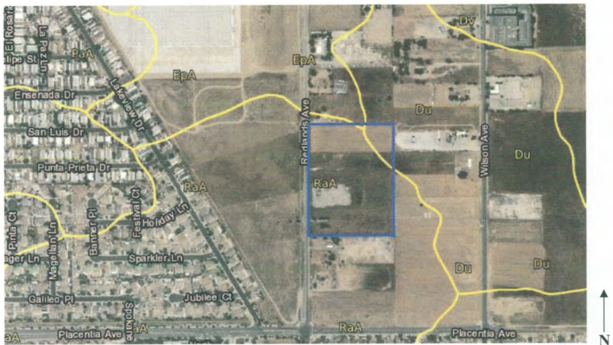
Figure 10. Soils map showing the project site (blue outline) and surrounding vicinity. Soil types, mapped by the U.S. Department of Agriculture, are indicated by letter abbreviations within mapped polygons of soil type. Soil on study site: RaA = Ramona sandy loams; Du = Domino silty loams; EpA = Exiter sandy loams. Soils are shown over aerial photographs (adapted from Knecht 1971).