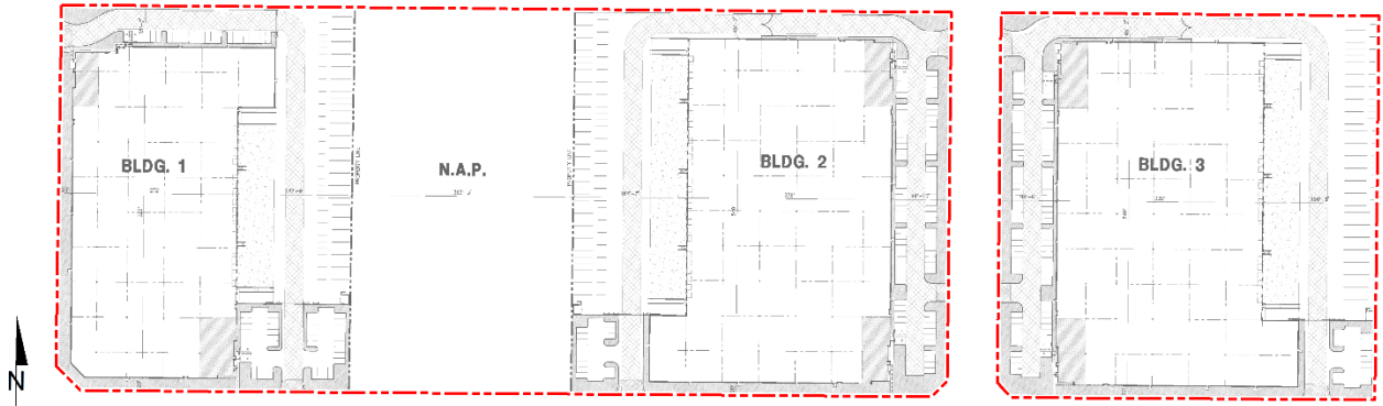
EXHIBIT 1-B: SITE PLAN