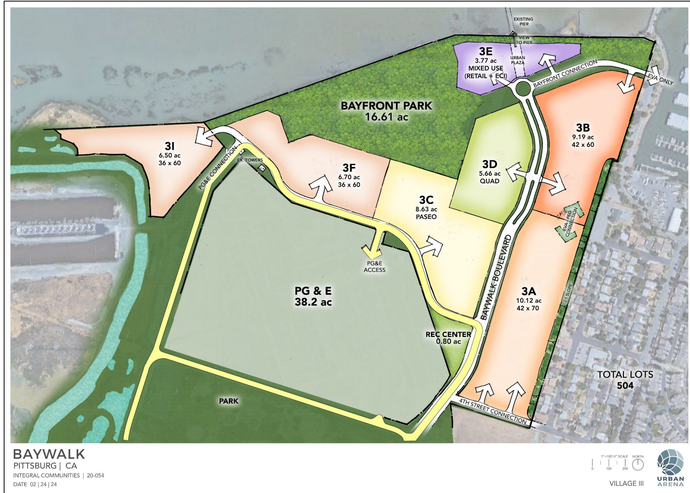
Figure 10 Preliminary Village III Site Plan