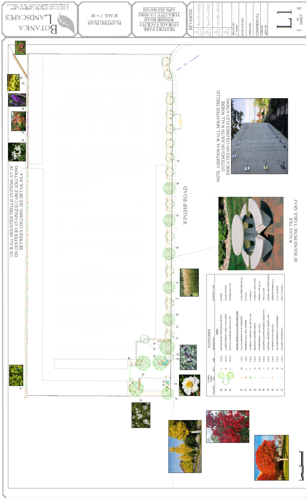
Figure 4: Landscape Plan