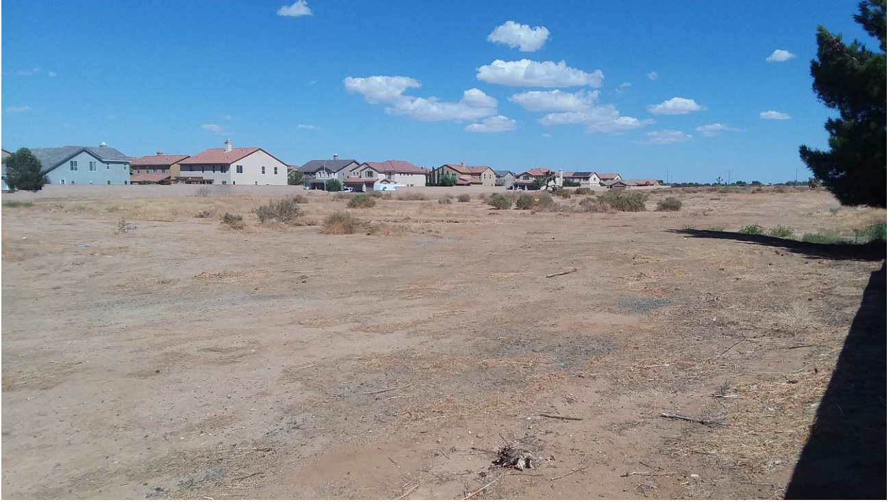
Figure 2 Project Area, View to the Northeast