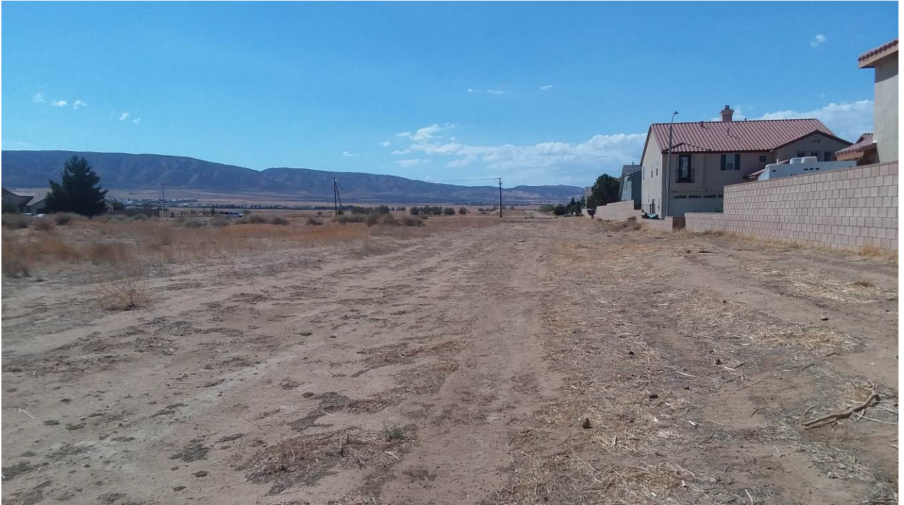
Figure 3 Project Area, View to the West