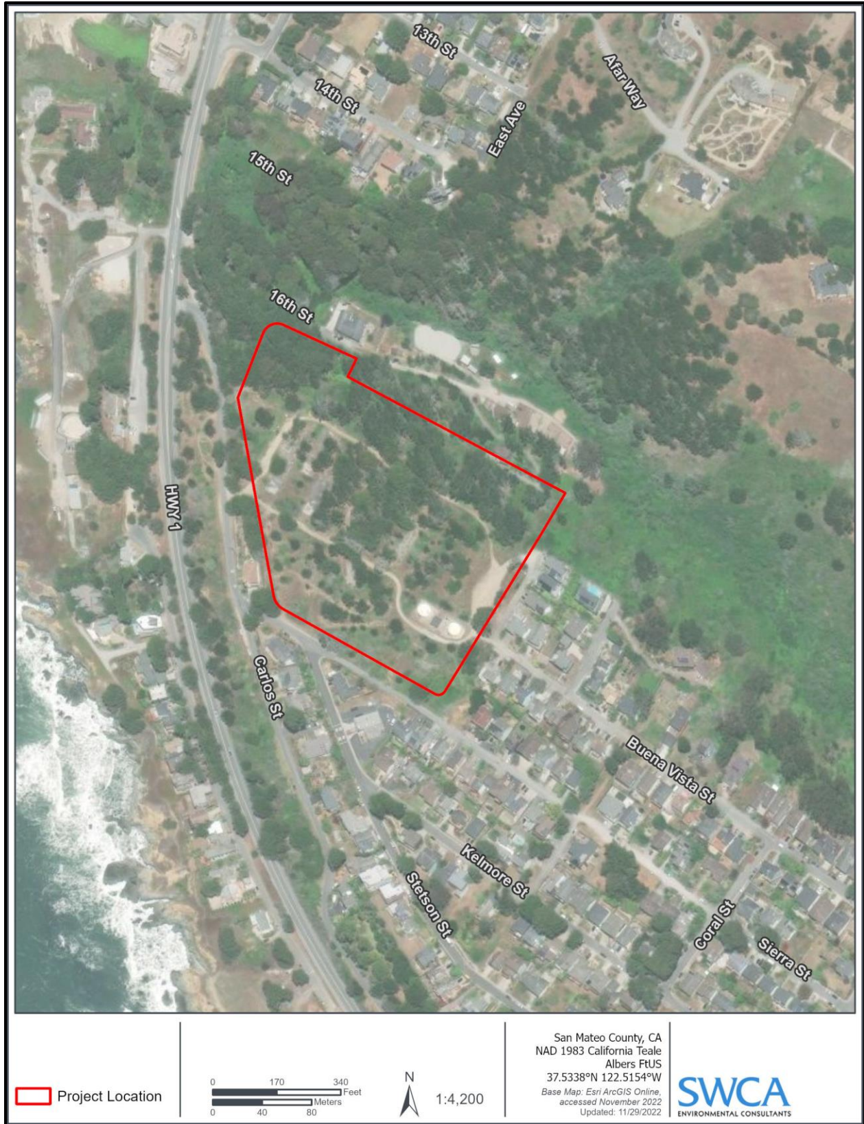
Figure 2. Project Location