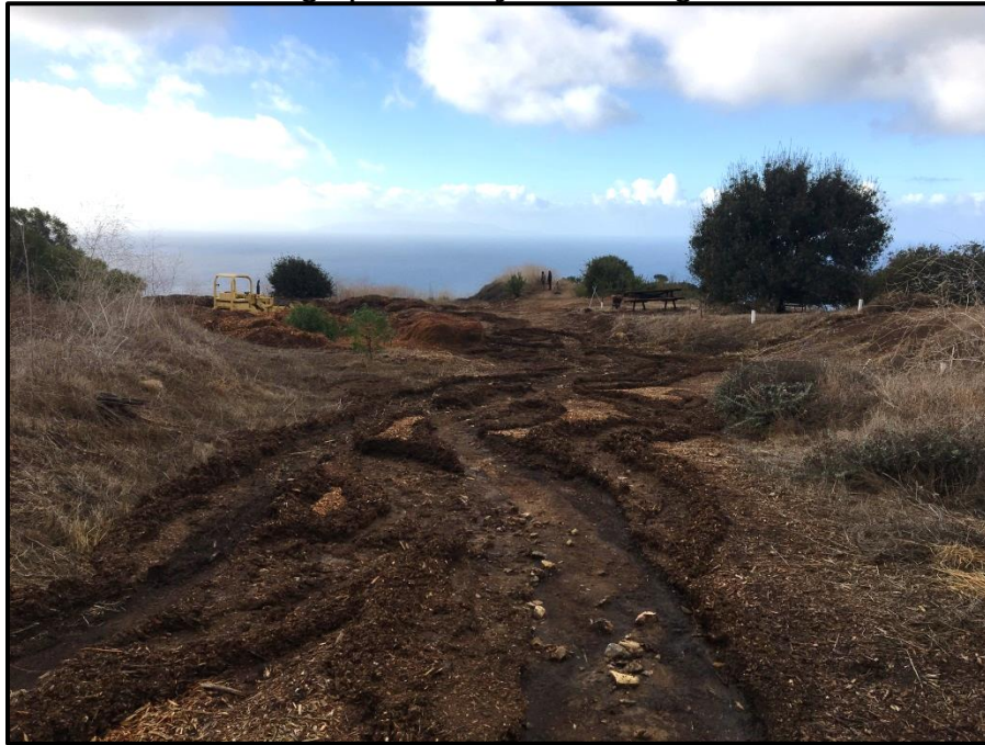
Photograph 1 Survey area, facing south

The survey area has been previously disturbed by grading of the existing easement, a fire road, and by earth moving equipment (e.g. tractor) to clear vegetation. Additionally, the majority of the survey area has been covered by imported mulch, reducing ground visibility to approximately 30 percent. Particular attention was paid to the exposed ground surfaces along the boundaries of the survey area, including along the easement alignment and along the recently developed drainage paths resulting from heavy rains (Photograph 1). No archaeological resources were identified during the field survey.