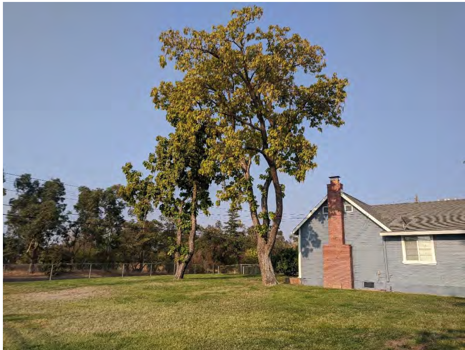
Photo 8. View of two catalpa trees (Tree #314 and #315) located next to the northern residence on APN 207-0011-001-0000.