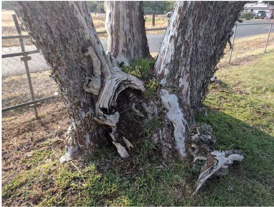
Photo 7. View of a basal trunk wound and rot in an Arizona cypress (Tree #313) on APN 207-0011-001-0000.