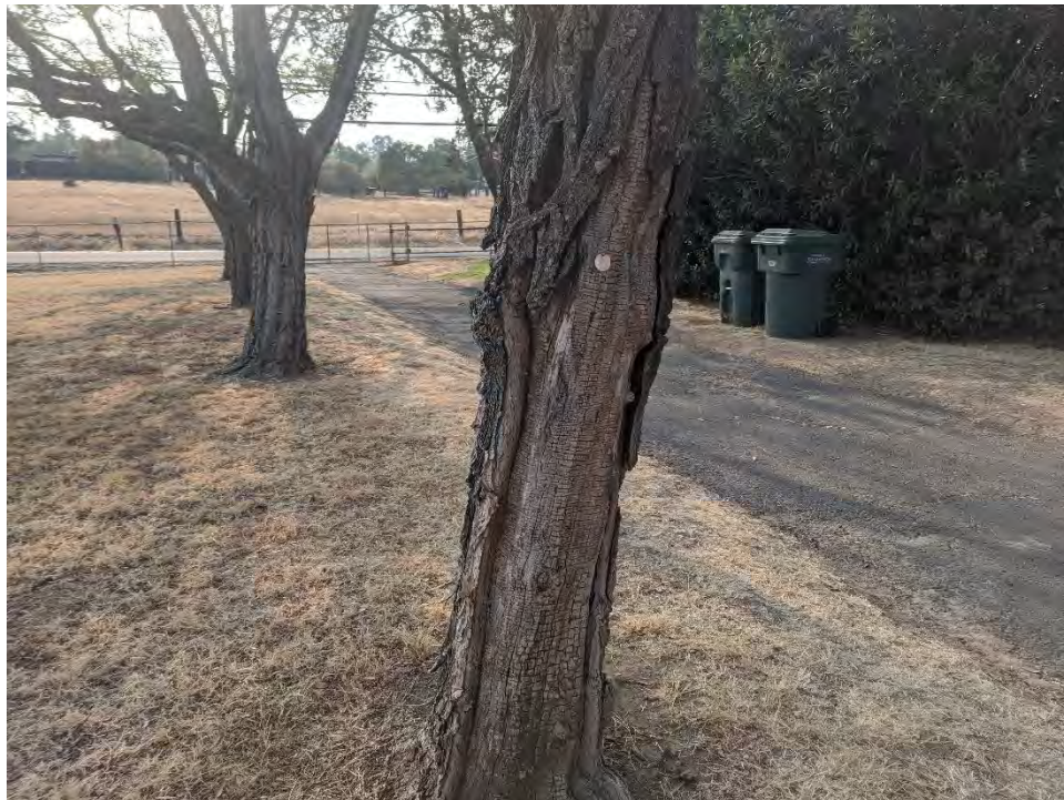
Photo 6. View of a large trunk wound and trunk rot in a honey locust (Tree #308) on APN 207-0011-001-0000.