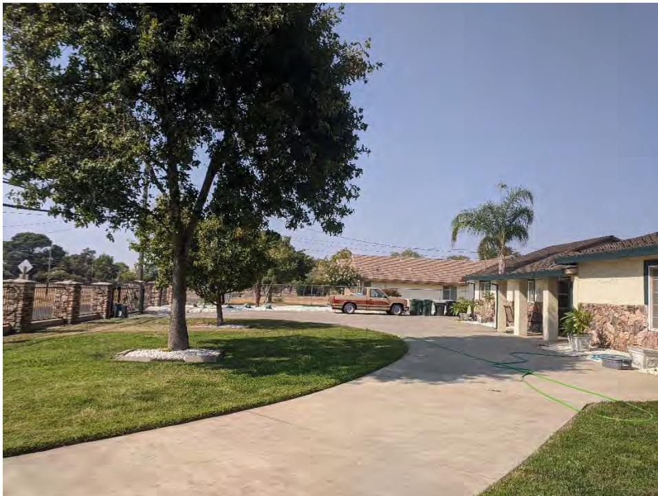
Photo 2. View of various ornamental trees in the front of the residence on APN 207-0011-001-0000.