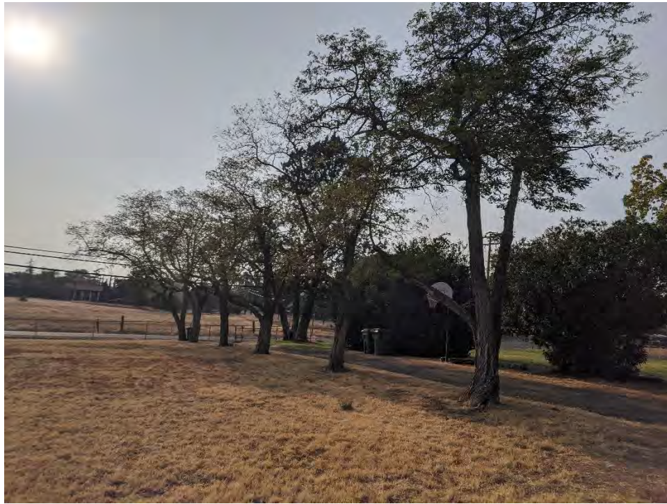
Photo 5. View of a line of honey locust trees located adjacent to a driveway on APN 207-0011-001-0000.