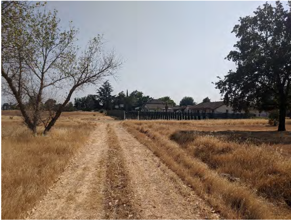
Photo 1. View of cottonwood and valley oak trees located in the non-native grassland on APN 207-0011-001-0000.