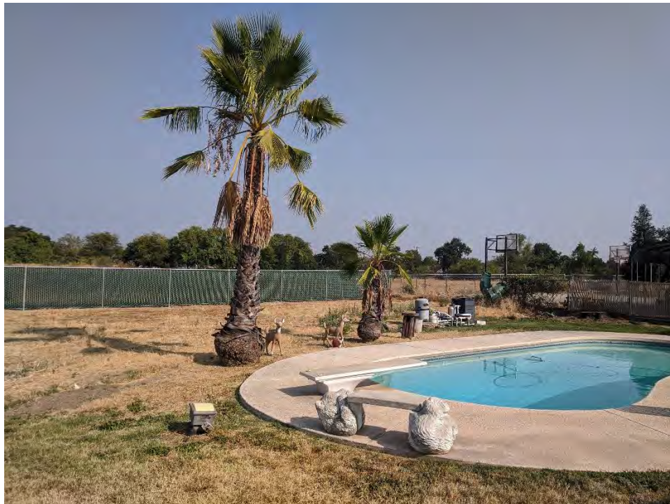
Photo 4. View of two Mexican fan palms (Tree #303 and #302) located next to a swimming pool behind the southern residence on APN 207-0011-001-0000.