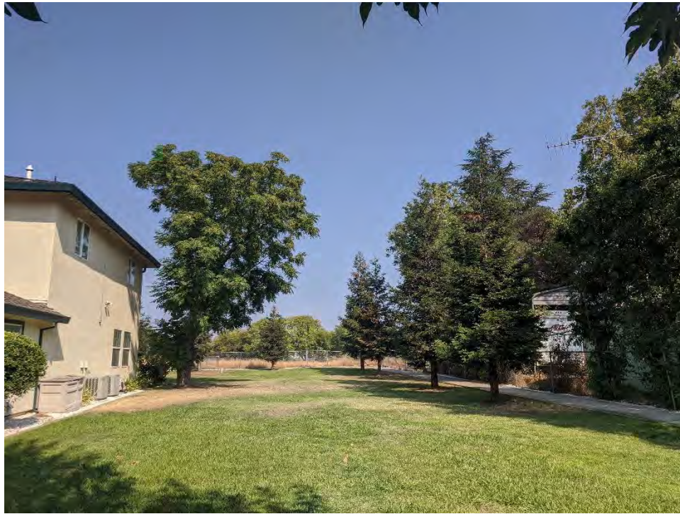
Photo 3. View of coastal redwoods and a chinaberry tree located south of the residence on APN 207-0011-001-0000.