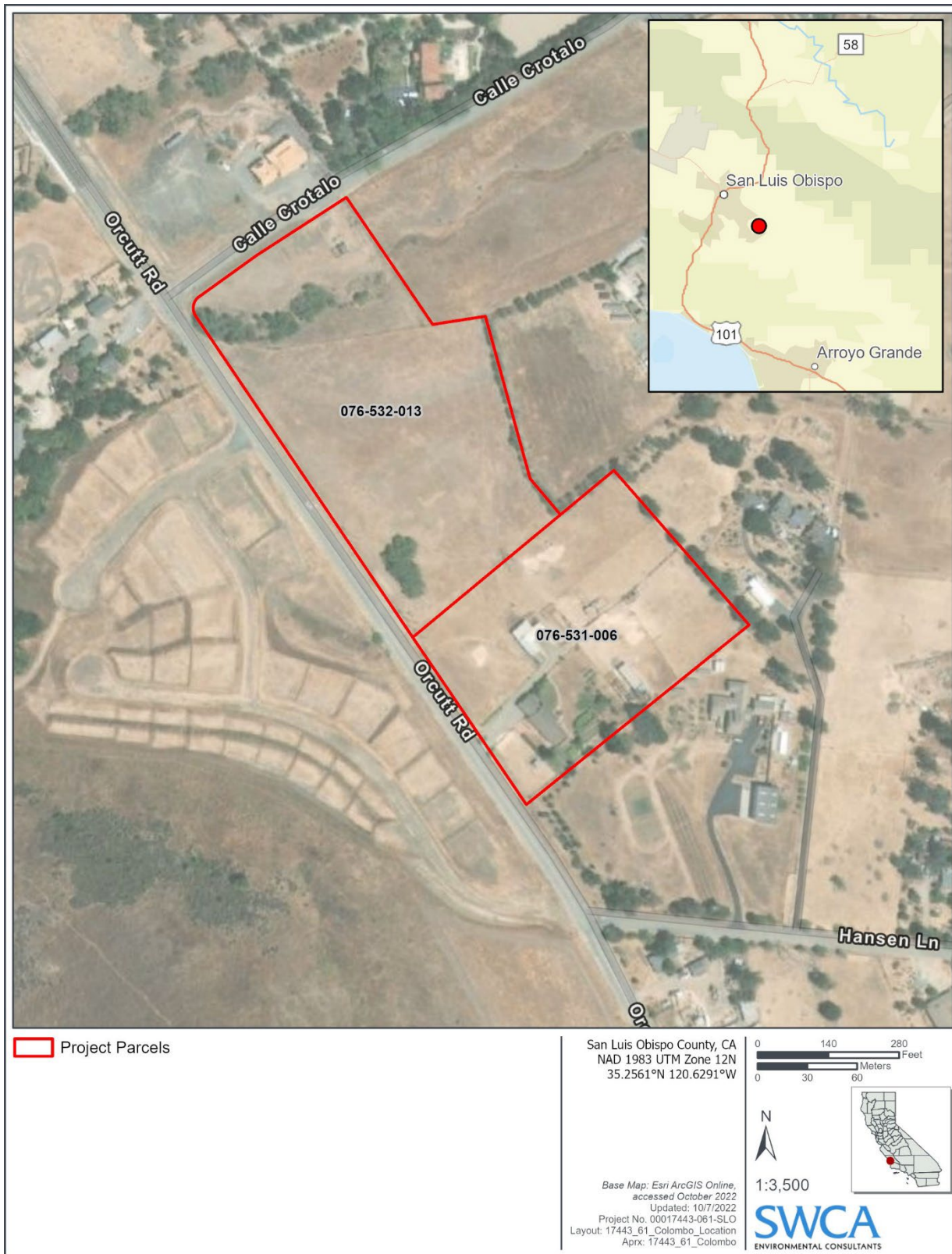
Figure 1. Project Location Map