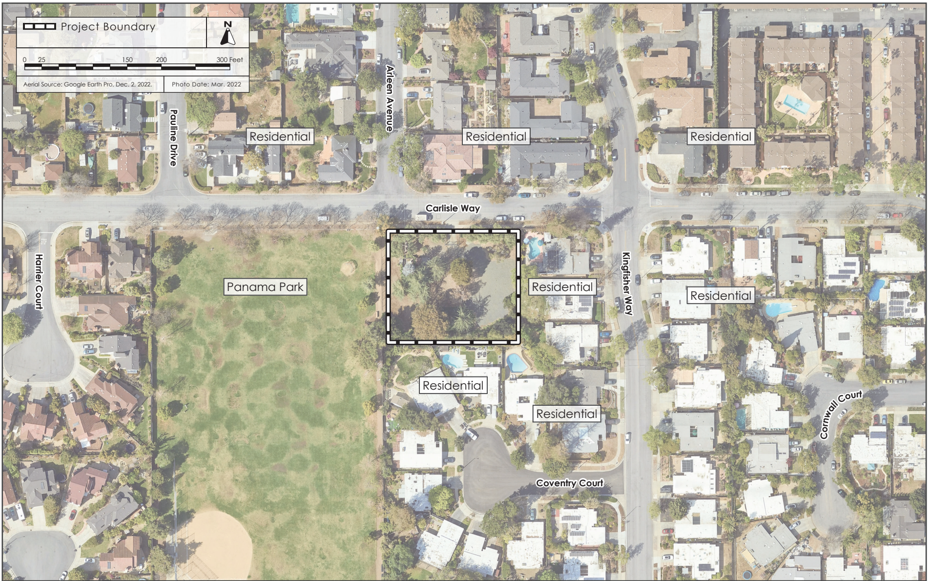
AERIAL PHOTOGRAPH AND SURROUNDING LAND USES