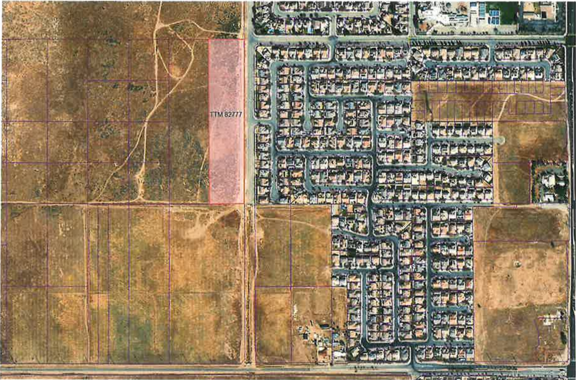
Figure 1, Project Location Map