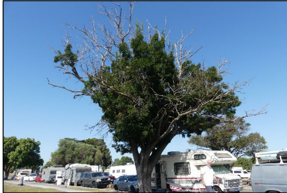
Photo 7. Looking northwest at Raywood ash #204. Note the extensive dieback in the crown.