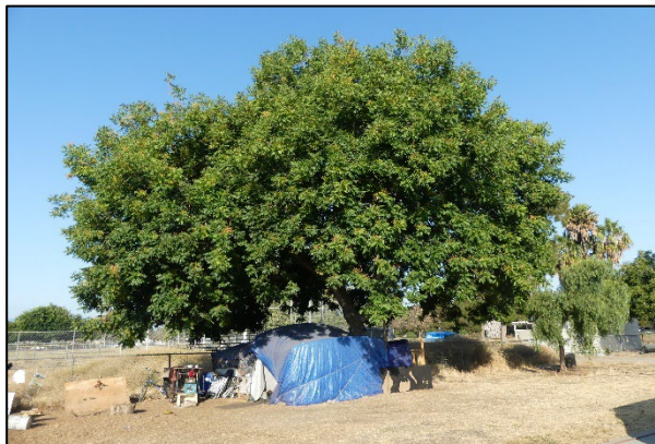
Photo 1. Structures were present around the base and lower trunk of this Chinese pistache as well as several others in the area.

Several trees located on Irene Street could not be tagged due to the presence of temporary structures around the trunk (Photo 1). Such trees were given a number, then assessed and mapped in normal manner. Trunk diameters were estimated. These trees are noted in the Tree Assessment Form .