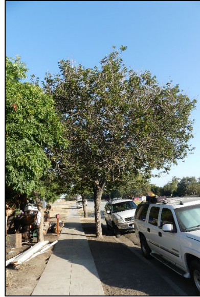
Photo 2. Typical Norway maple street tree. Note extensive twig dieback.

Fourteen coast live oaks were concentrated in the south side of the park and along Taylor Street (Photo 3). Trees ranged from young to mature in development with trunk diameters from 7 to 30 in. Half of the trees had more than one stem that arose near ground level. The lower trunks of several trees were embedded in chain link fencing.