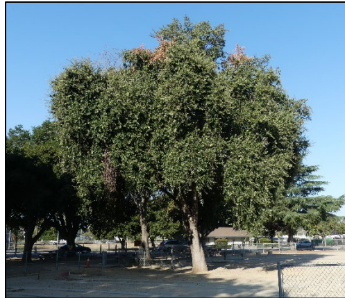
Photo 9. Looking west at valley oak #151. Note dead branches in upper crown.