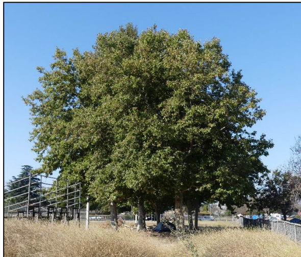
Photo 10. Looking west at grove of western sycamores.