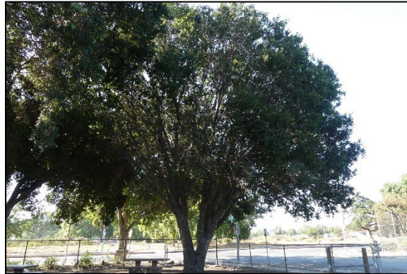
Photo 3. Coast live oak #148 had trunks of 26 and 25 in. and was in fair condition.

Most coast live oaks (11 trees) were in fair condition while trees #125, 183 and 188 were in good condition. Factors influencing tree condition included overall form and structure, the presence of codominant stems and multiple attachments and overall canopy density.