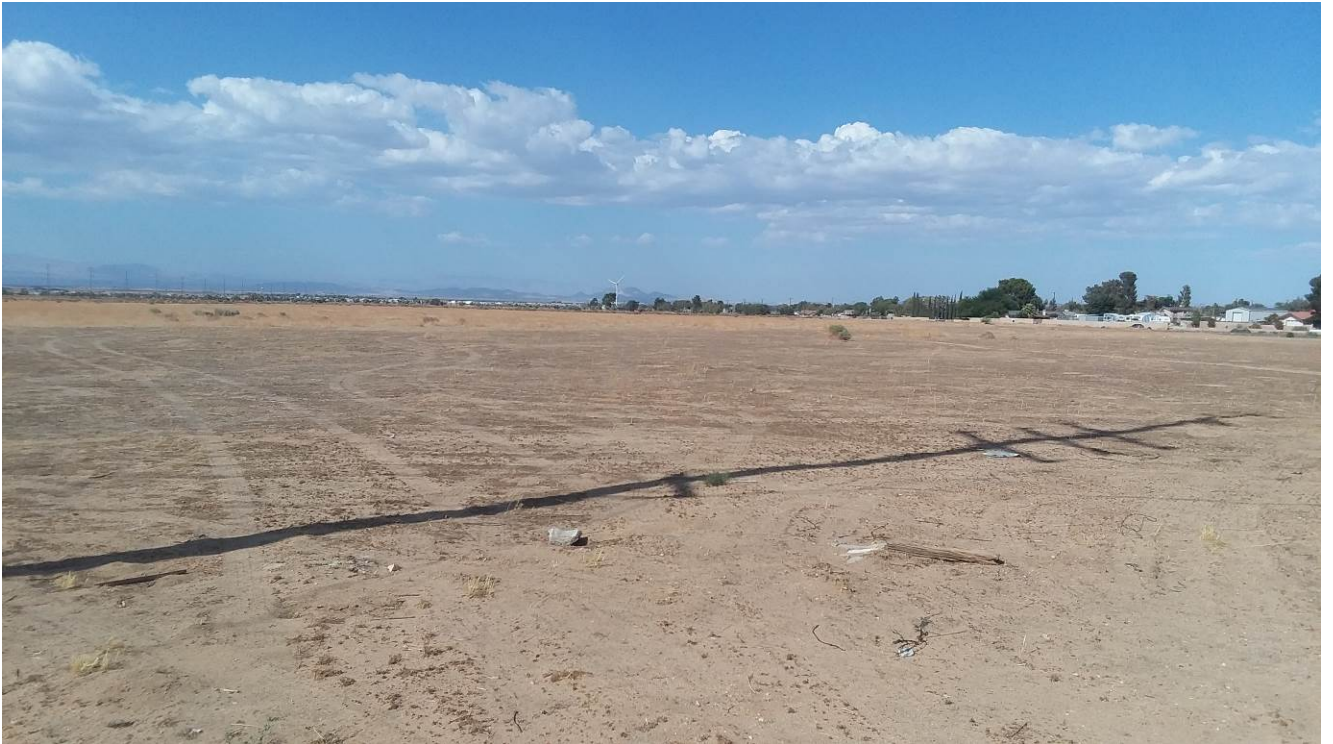
Figure 3 Project Area, View to the Northeast