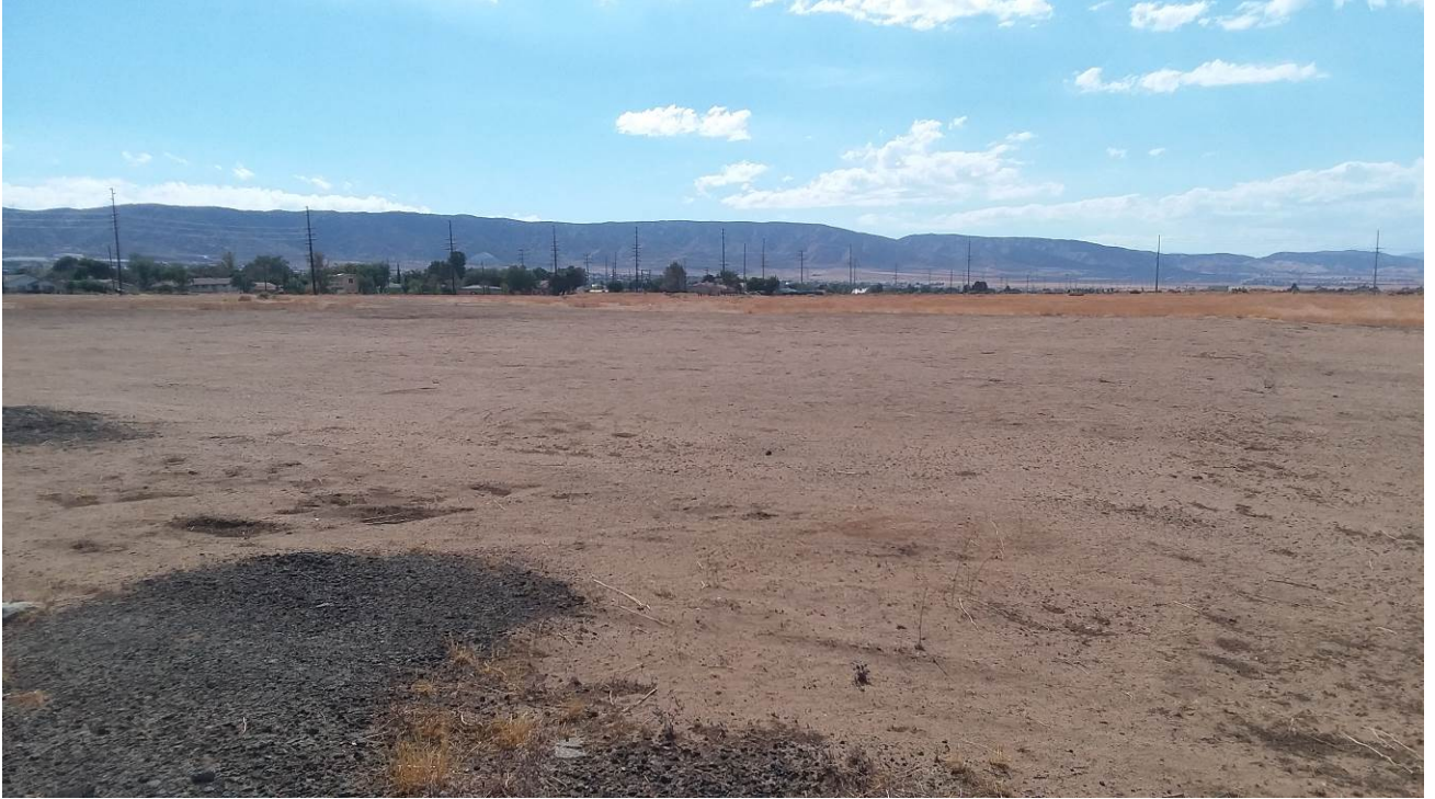
Figure 2 Project Area, View to the Southwest