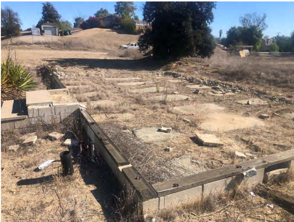
Photograph 8. View of foundation in northern portion of APE, facing east.