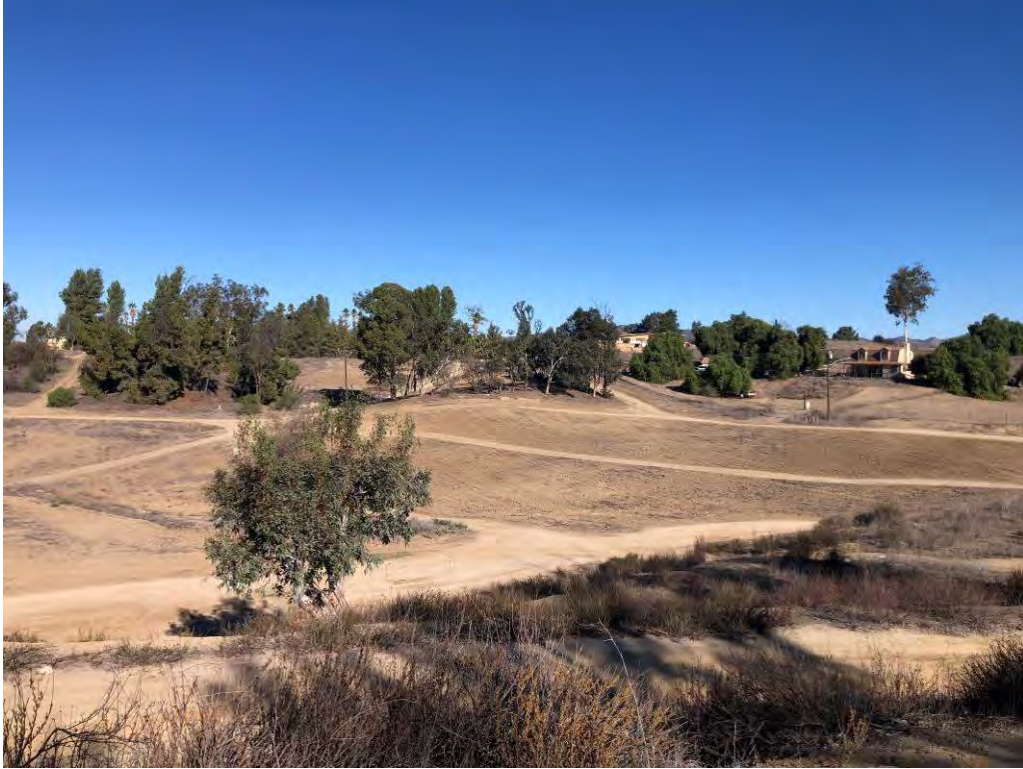
Photograph 5. View of central portion of APE, facing northeast.