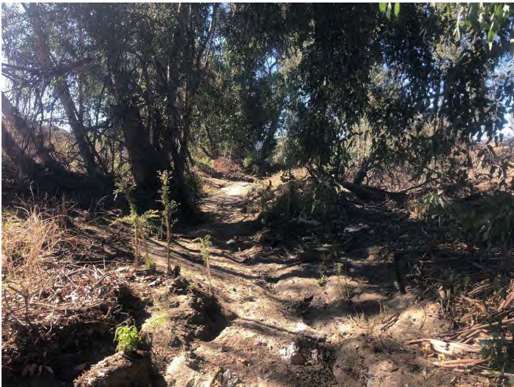
Photograph 2. View of drainage in southern portion of APE, facing west.