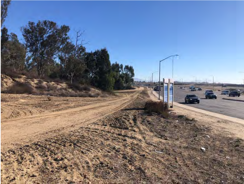
Photograph 1. View from southwest corner of APE, facing east.