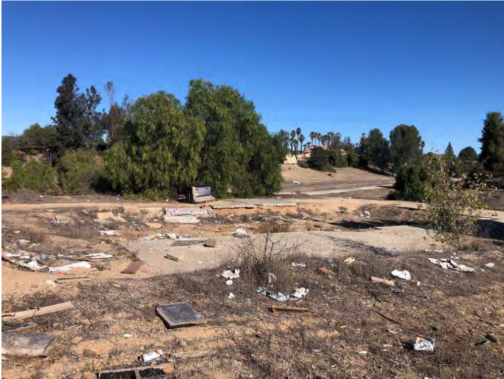
Photograph 7. View of foundation in northern portion of APE, facing north.