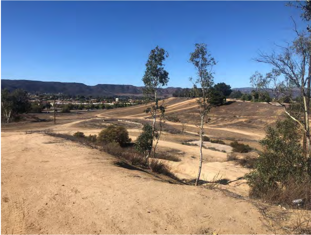
Photograph 3. View of central portion of APE, facing west.