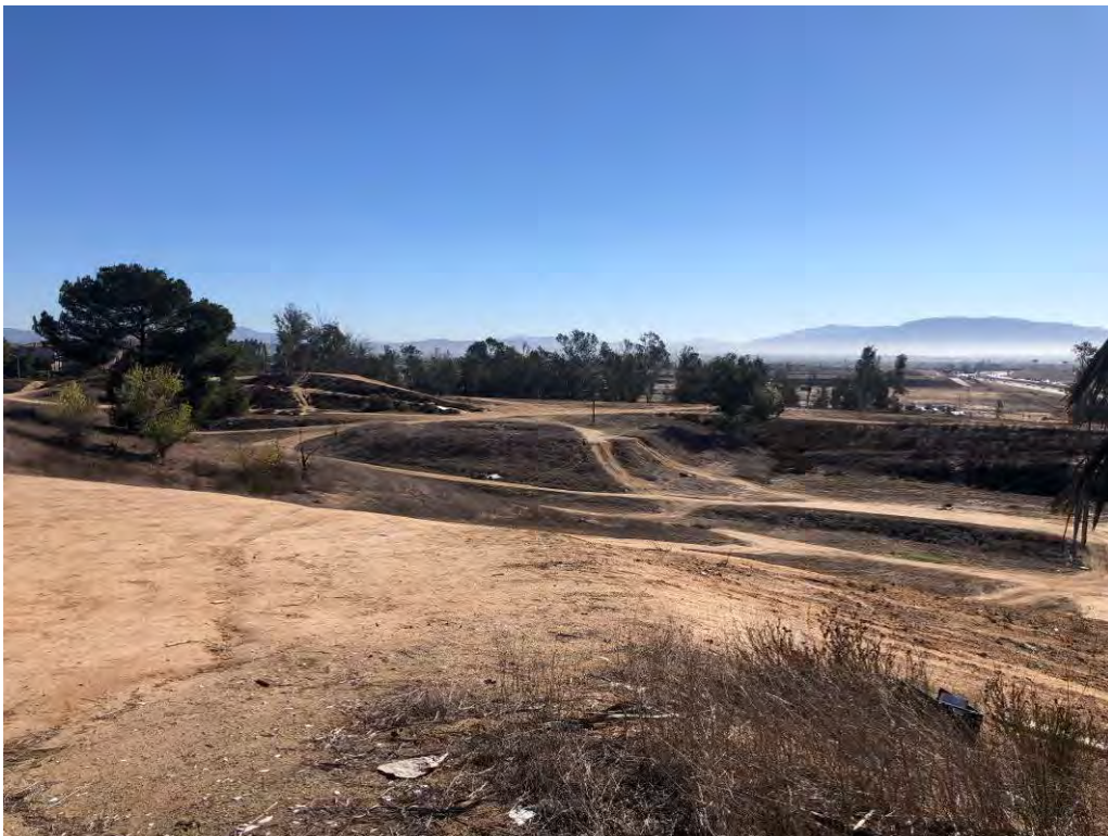
Photograph 4. View of central portion of APE, facing south.