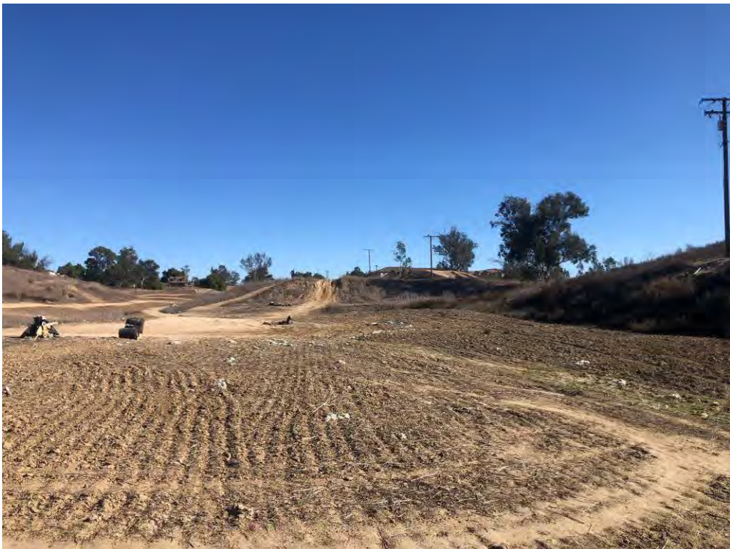
Photograph 6. View of central portion of APE, facing east.