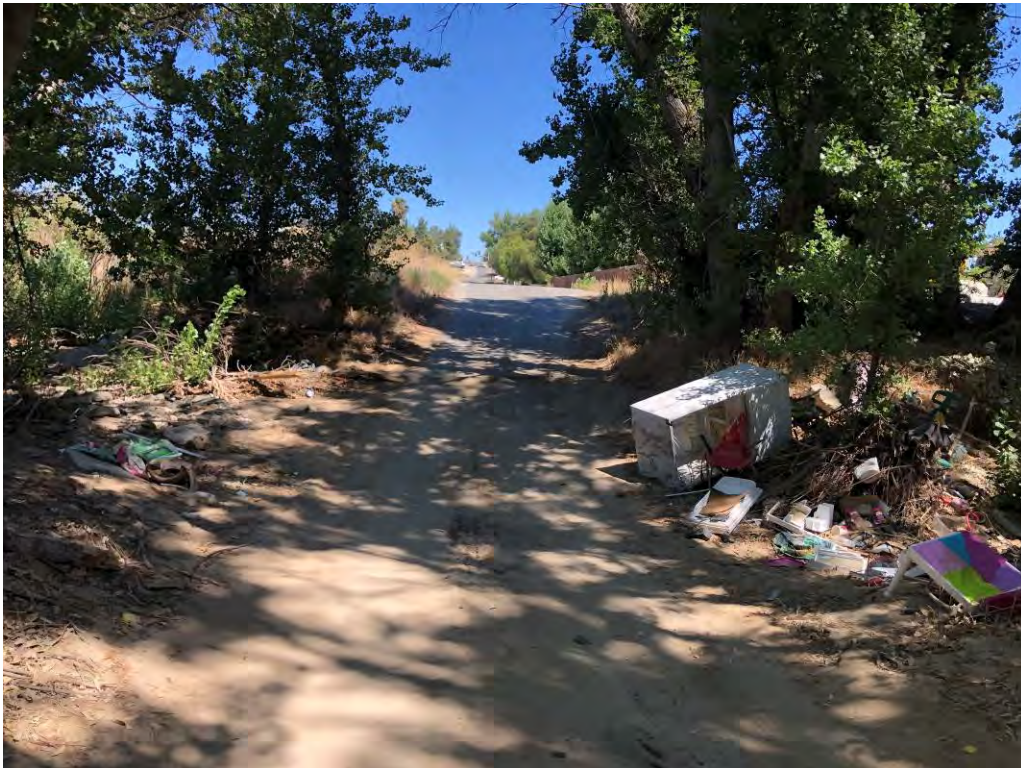
Photograph 10. View of drainage crossing in Monroe Avenue, facing northwest.