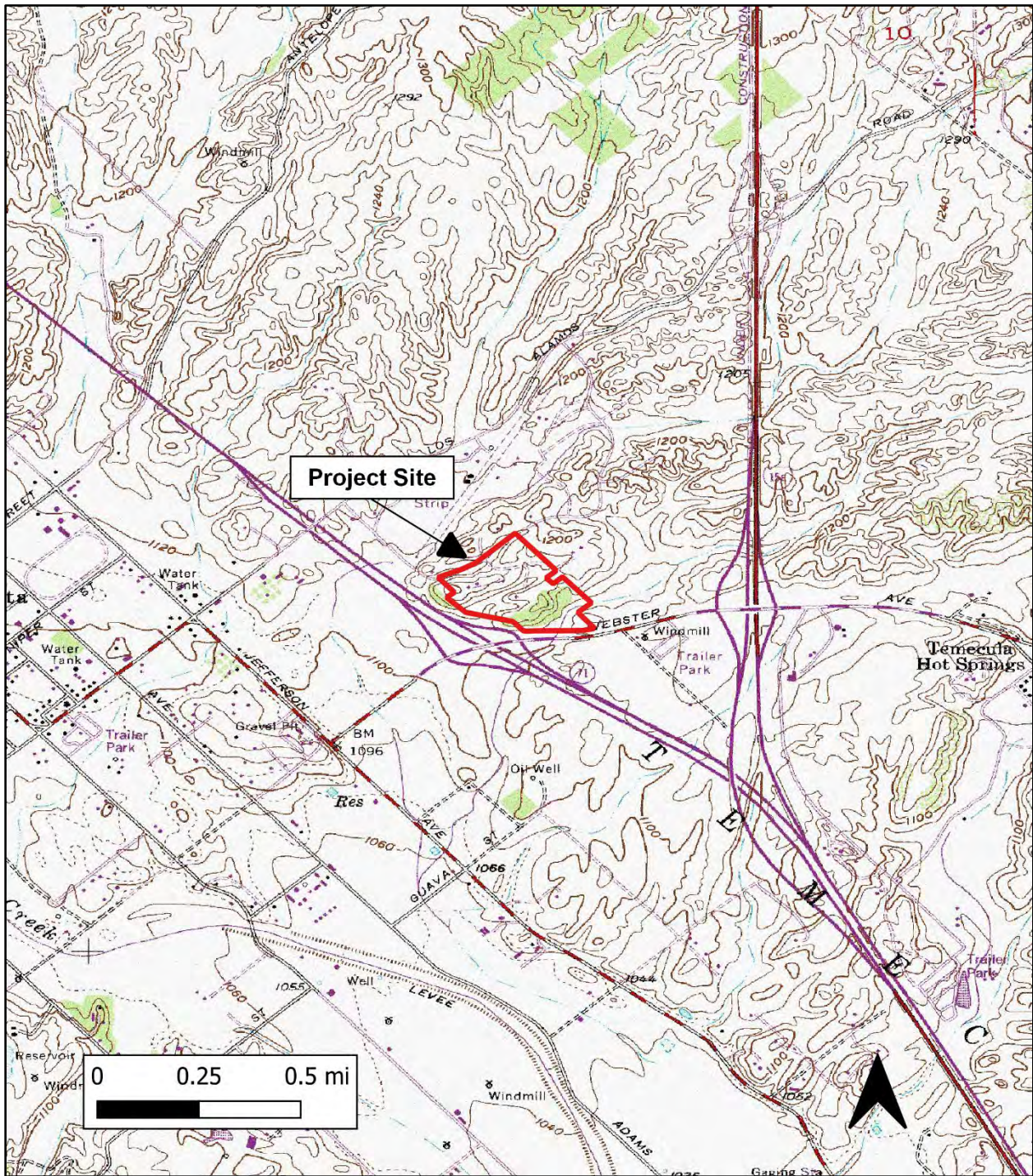
Project Location Map