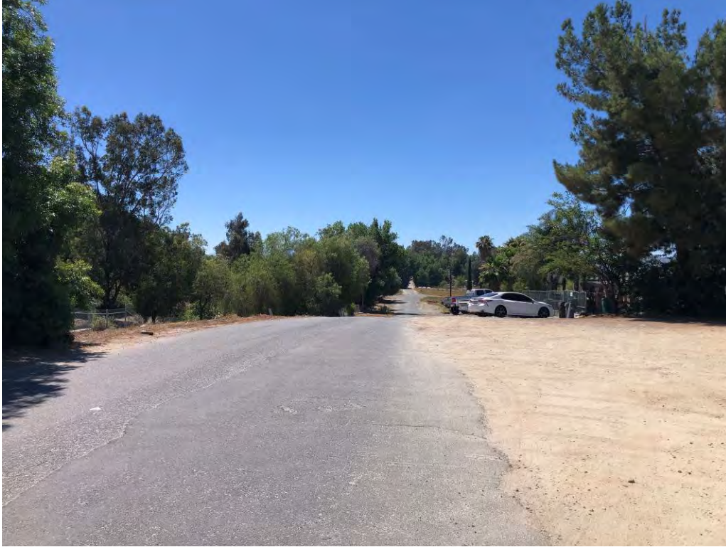
Photograph 9. View of waterline alignment in Monroe Avenue, facing southeast.