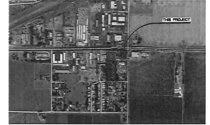
3 VICINITY MAP SCALE NO SCALE