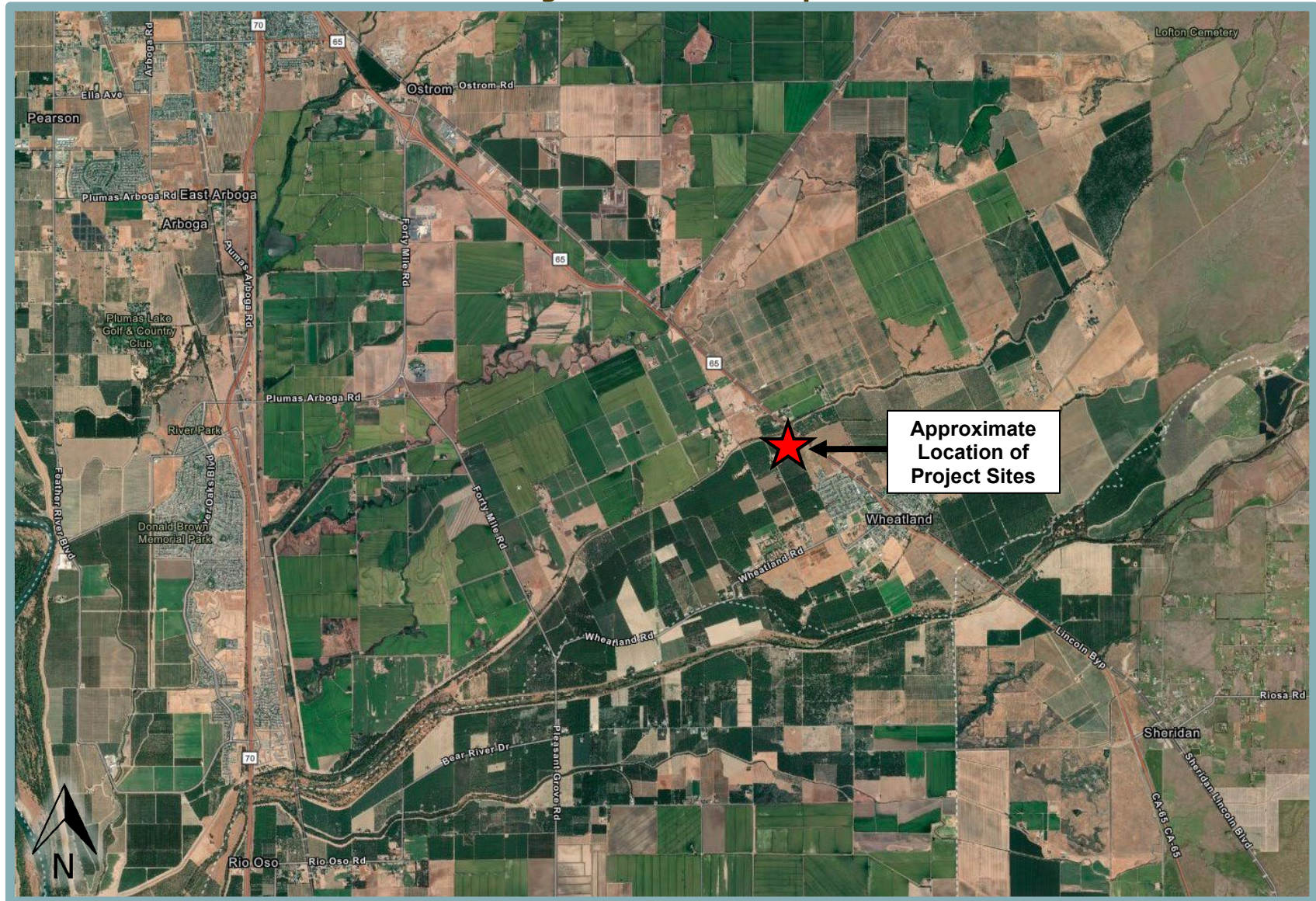
Figure 1 Regional Location Map