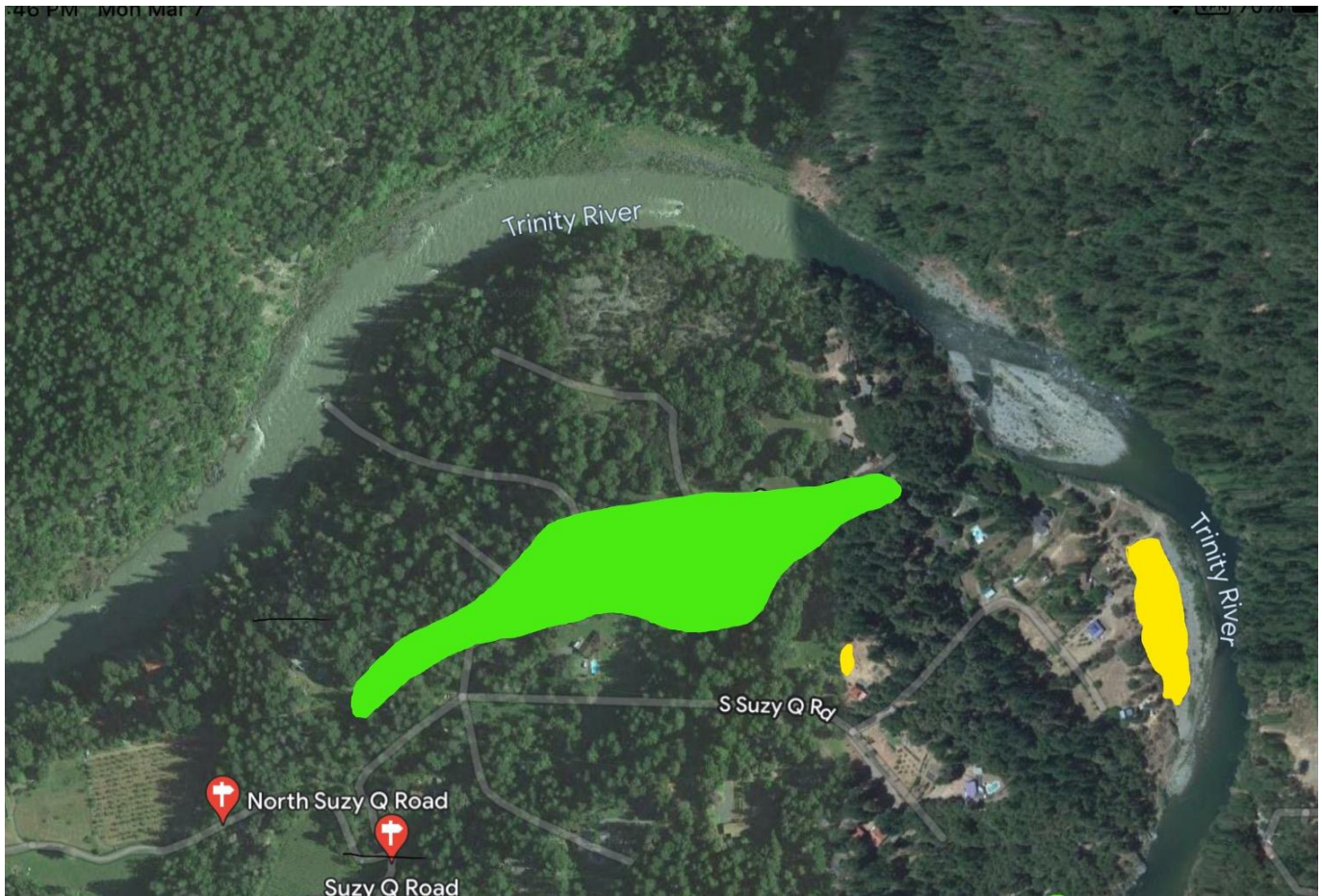
Figure 2. The Scotch broom ( Cytisus scoparius ) population boundary is represented by the bright green polygon. Yellow star-thistle, represented by the bright yellow polygon, is not associated with this environmental review.