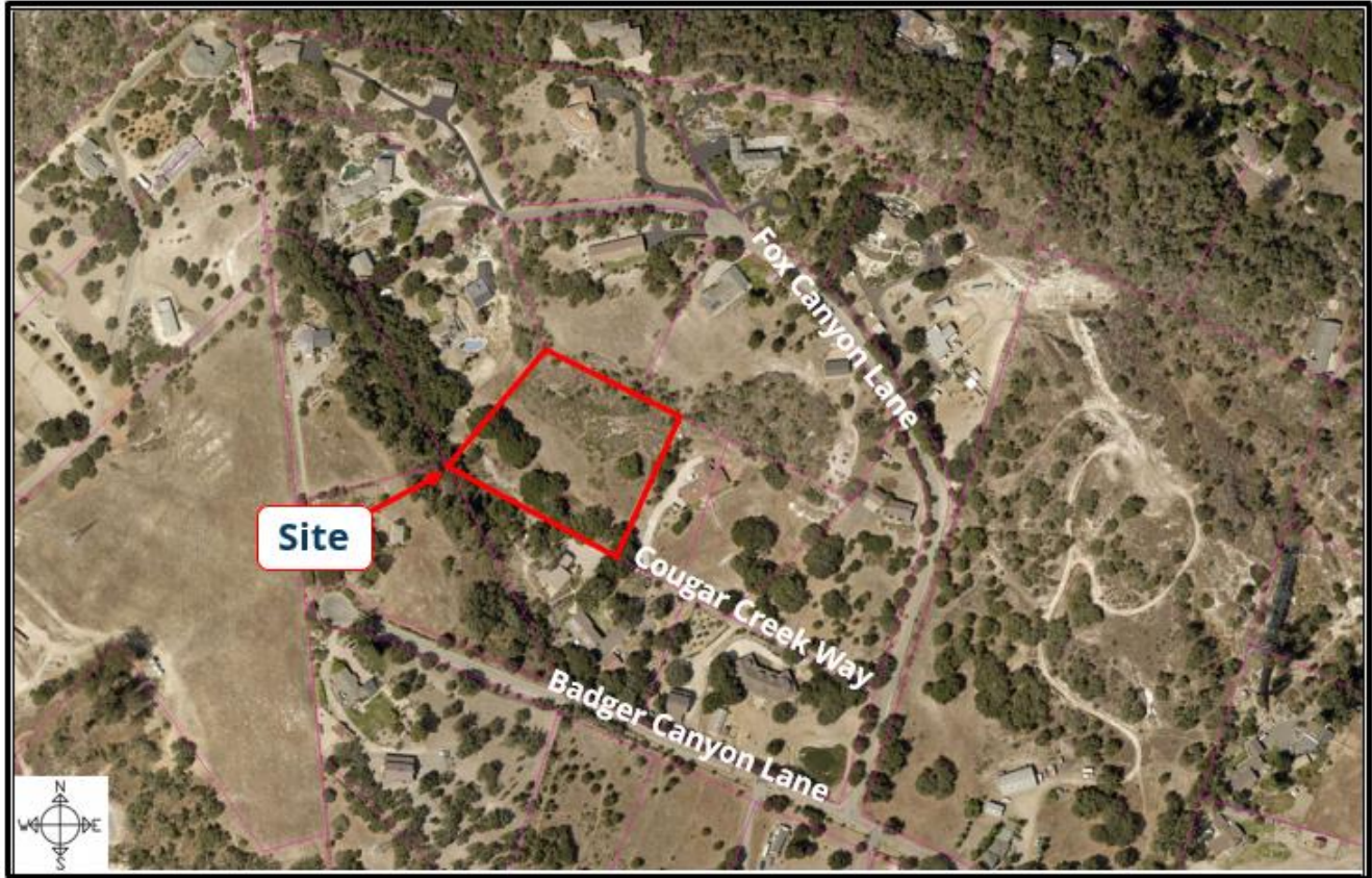
Figure 2. Project Boundary Aerial