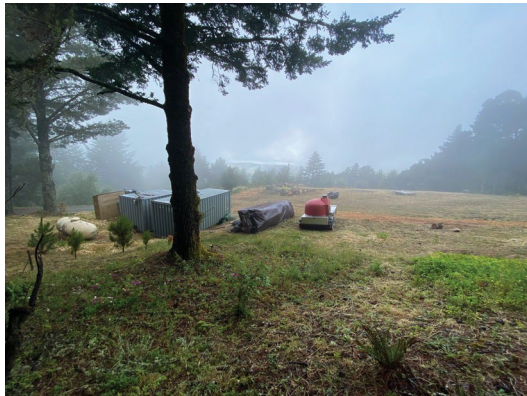
① Site Overview to the west.