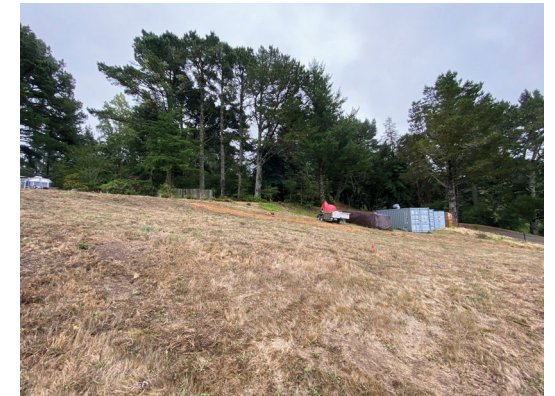
② Site Overview to the southeast.