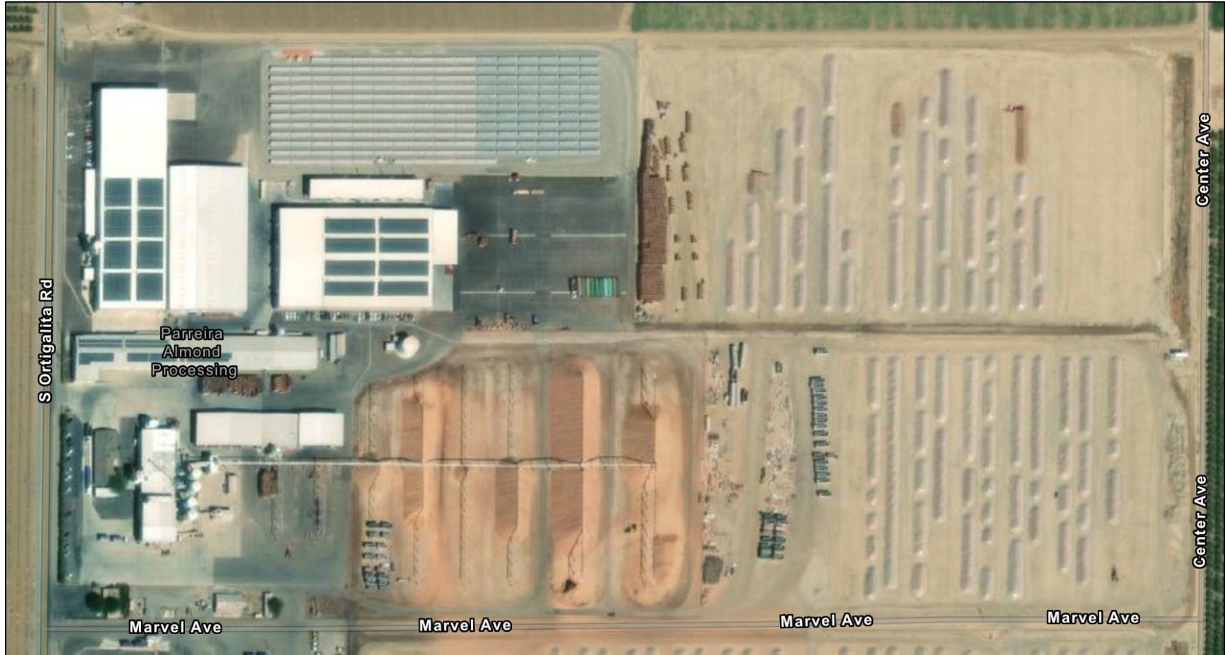
Aerial Photo: Conditional Use Permit No. CUP22-016