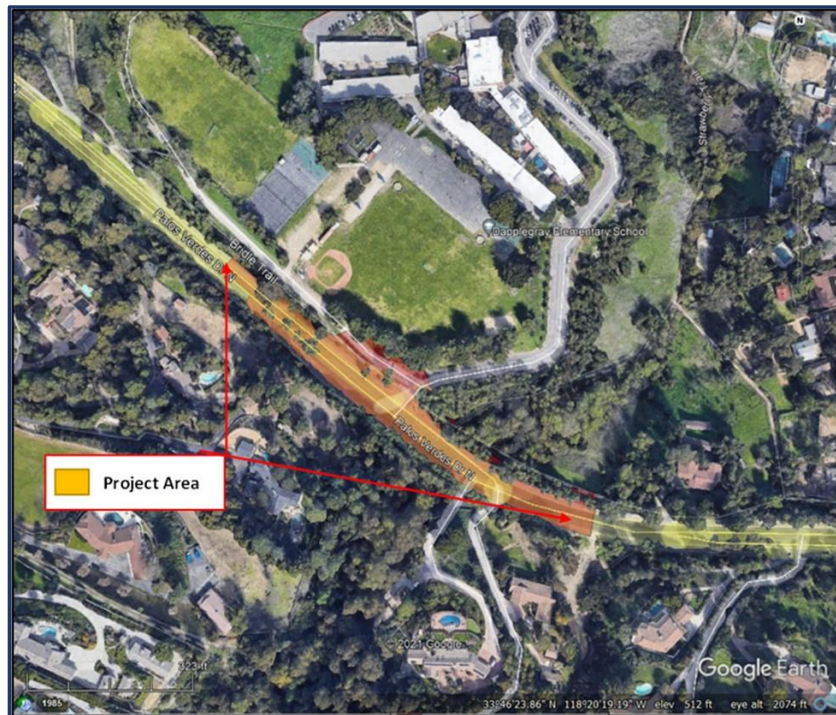
Figure 2- Project Location and Limits of Construction