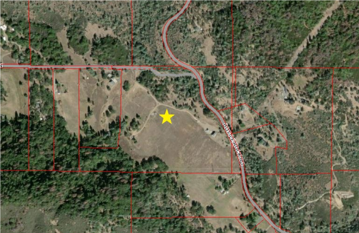
Figure 1. Vicinity Map

One (1) A-Type 13 Self-distribution License: In the “RL” zoning district the Type 13 Distributor Only, Self-distribution State licenses are an accessory use to an active cannabis cultivation or cannabis manufacturing license site with a valid minor or major use permit. Per Article 27 Section 11 (ay), the parcel where the distributor transport only, self-distribution license is issued shall front and have direct access to a State or County maintained road or an access easement to such a road, the permittee shall not transport any cannabis product that was not cultivated by the permittee, and all non-transport related distribution activities shall occur within a locked structure. Furthermore, all guidelines for Distributor Transport Only License from the California Department of Cannabis Control’s Title 4, Division 19, Chapter, as described in §15315, must be followed.