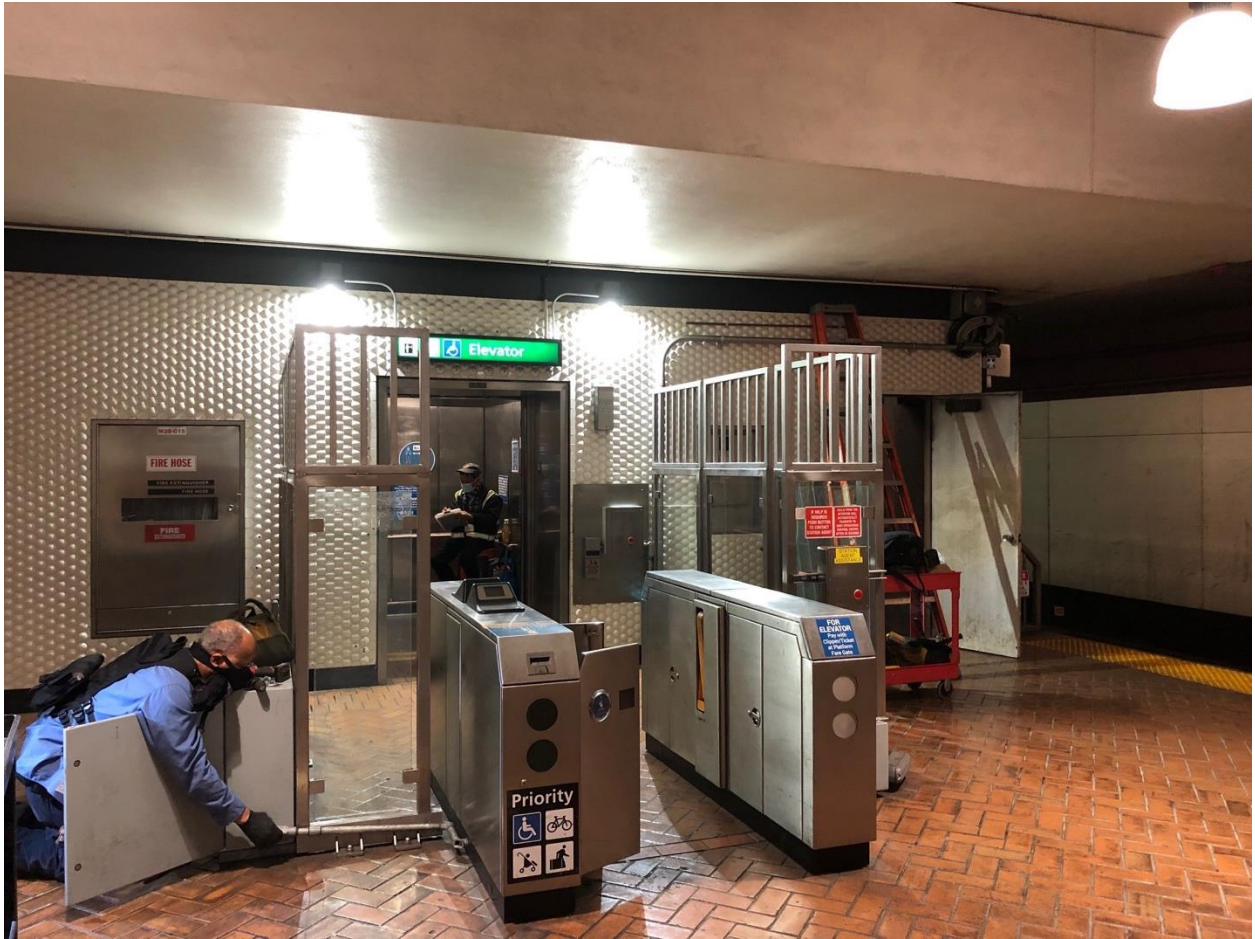
Photo of Fare Gate and Enclosure at Elevator to Street