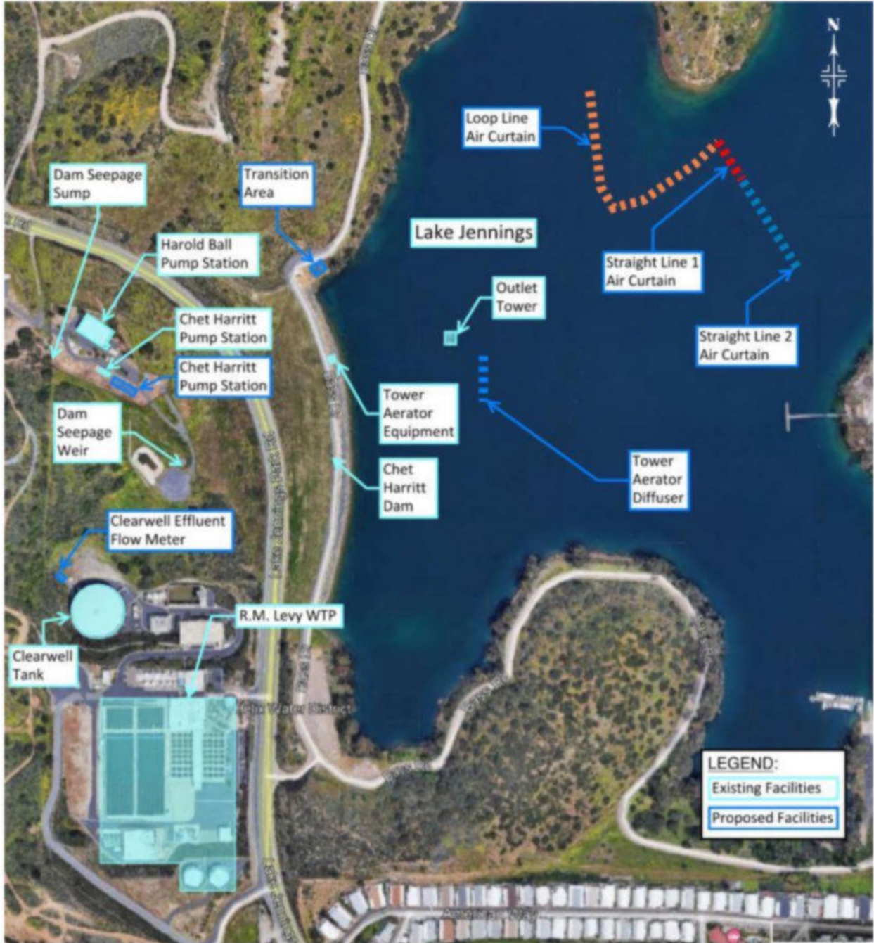
Figure 2. Project Location and District Facilities