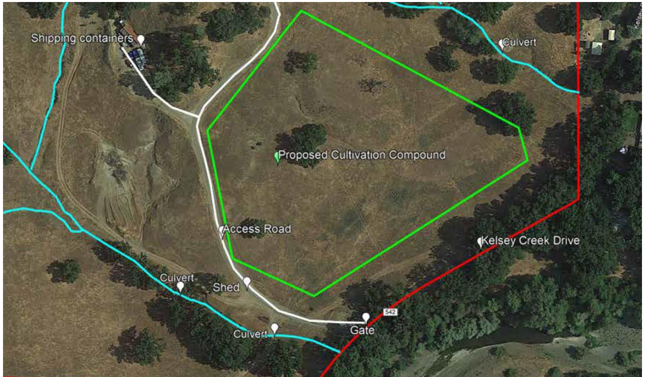
FIGURE 2 – PROPOSED SITE PLAN

(SMP) and a Nitrogen Management Plan (NMP). The purpose of the SMP is to identify Best Practicable Treatment or Control (BPTC) measures that the site intends to follow for erosion control purposes and to prevent stormwater pollution. The purpose of the NMP is to identify how nitrogen is stored, used, and applied to crops in a way that is protective to water quality. The SMP and NMP are required prior to commencing cultivation activities.