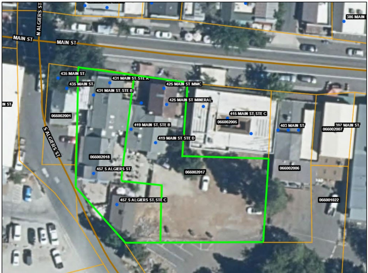
Figure 2- Aerial Photo (Parcel boundary lines shown in green do not reflect the actual location)