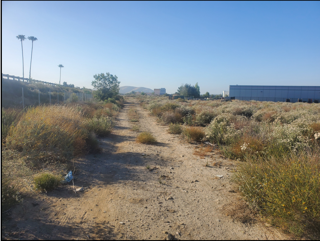
Plate 3.2–3: Overview of the dirt road along the northeast perimeter, facing southeast.