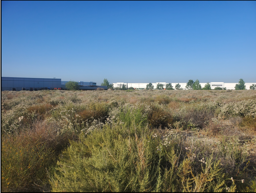
Plate 3.2-1: Overview of the project from the north corner, facing south.