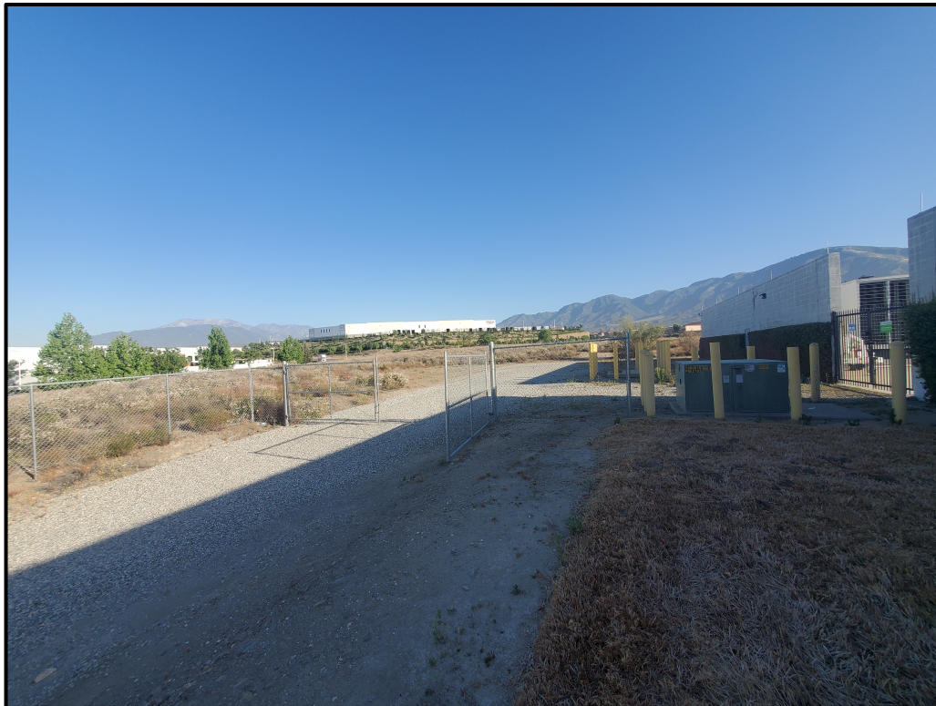
Plate 3.2–4: Overview of the gravel driveway located along the south perimeter, facing north.