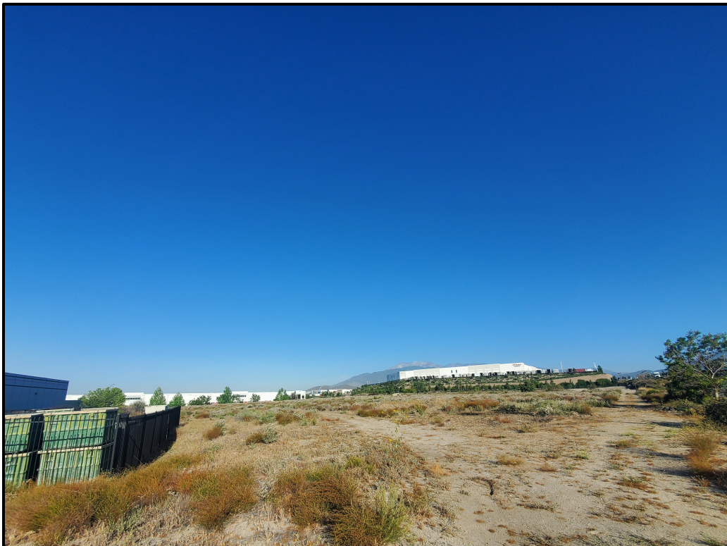
Plate 3.2-2: Overview of the project from the east corner, facing west.