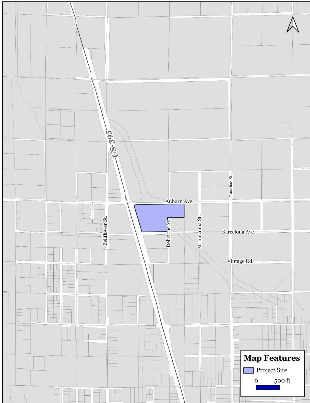
FIGURE 2. VICINITY MAP