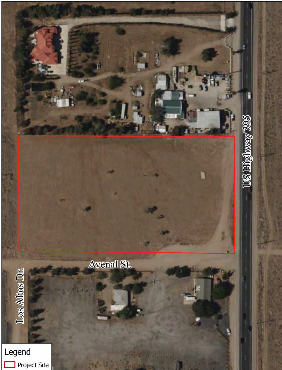
Figure 2 -Aerial View Freight Company Project