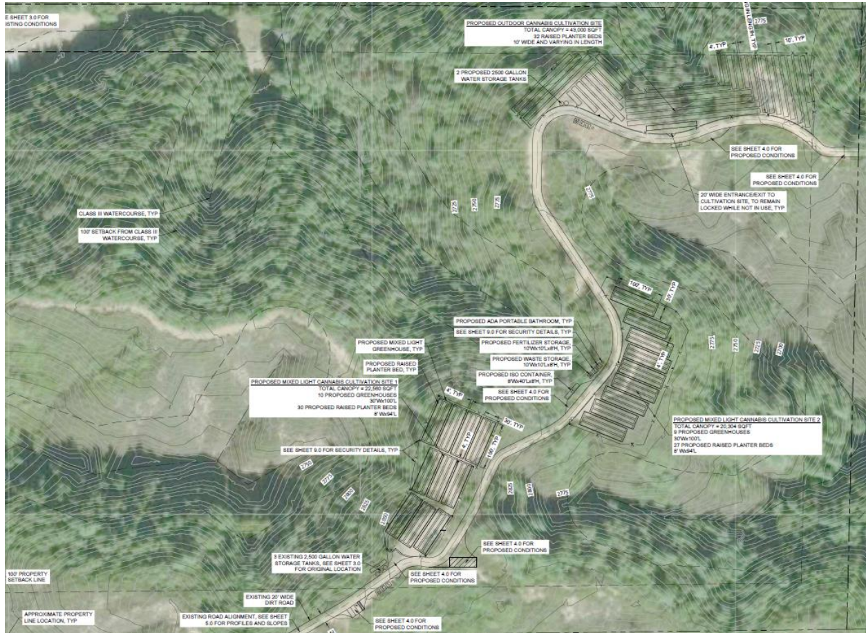
Source: Sheet 6, Site Plans submitted by Applicant