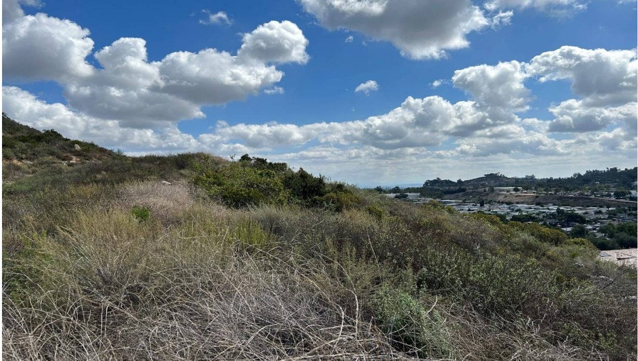
Photograph 3. Southeast-facing representative photograph of the Project Area. Photograph taken within the southwestern portion of the Project Area on September 20, 2023.