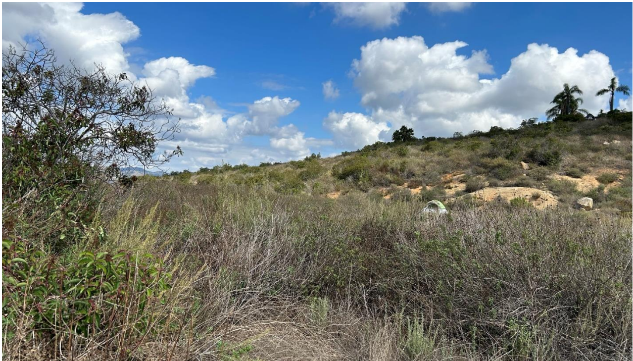
Photograph 4. North-facing representative photograph of the Project Area. Photograph taken within the southern portion of the Project Area on September 20, 2023