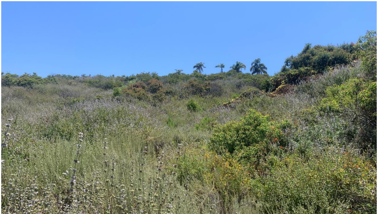
Photograph 2. South-facing representative photograph of the Diegan coastal sage scrub within the northern portion of the Project Area. Photograph taken on June 16, 2023.