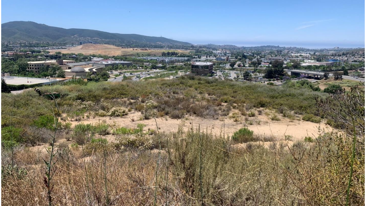
Photograph 1. South-facing representative photograph of the middle, disturbed, portion of the Project Area. Photograph taken on June 16, 2023.