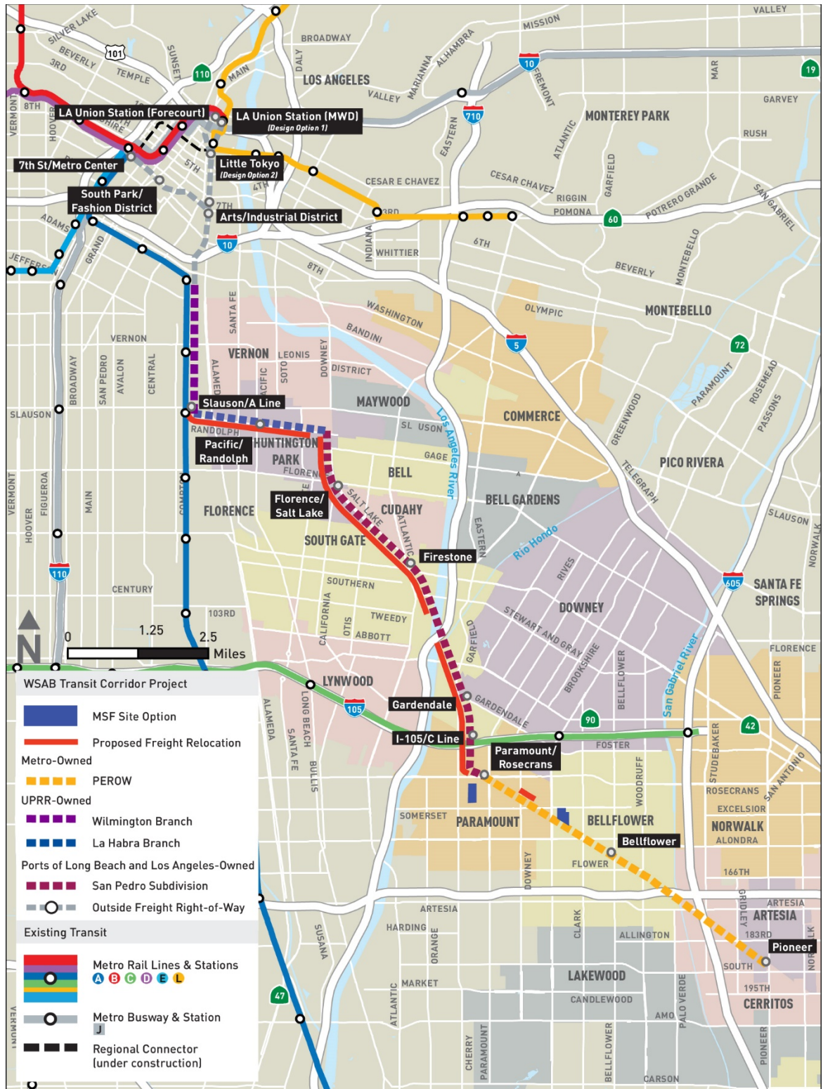
Figure 2-6. Existing Rail Right-of-Way Ownership