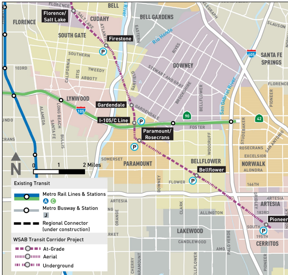
Figure 2-4. Southern Section

The Southern Section includes approximately 11 miles of Build Alternatives 1, 2, and 3 and includes all 6.6 miles of Alternative 4. The Southern Section covers the geographic area from south of Florence Avenue in the City of Huntington Park to the City of Artesia and traverses the Cities of Huntington Park, Cudahy, South Gate, Downey, Paramount, Bellflower, Cerritos, and Artesia (Figure 2-4). In the Southern Section, all four Build Alternatives would utilize portions of the San Pedro Subdivision and the Metro-owned PEROW (between approximately Paramount Boulevard to South Street).