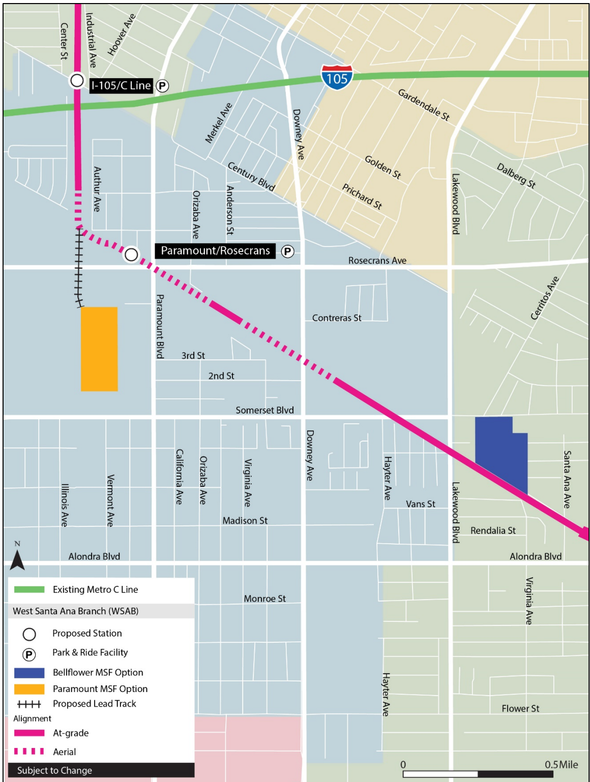
Figure 2-7. Maintenance and Storage Facility Options