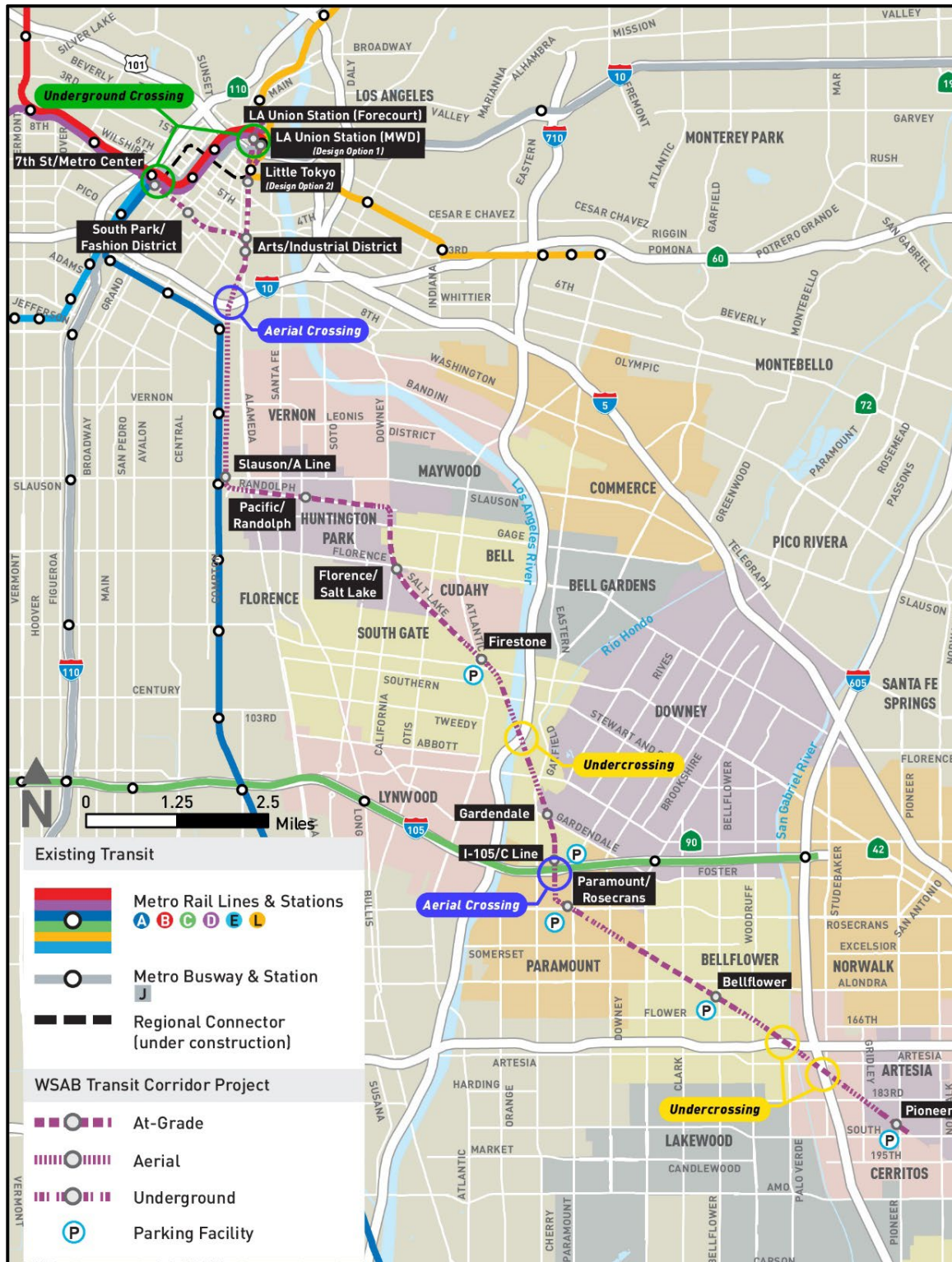
Figure 2-5. Freeway Crossings