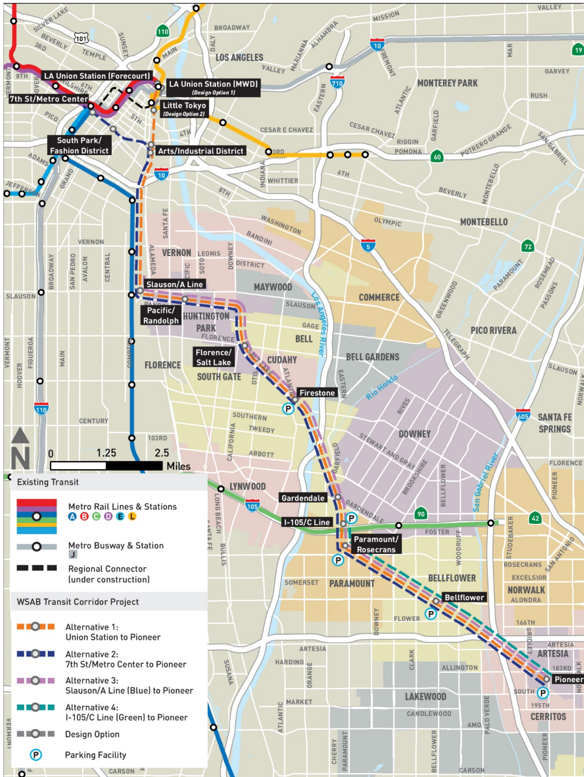
Figure 2-1. Project Alternatives