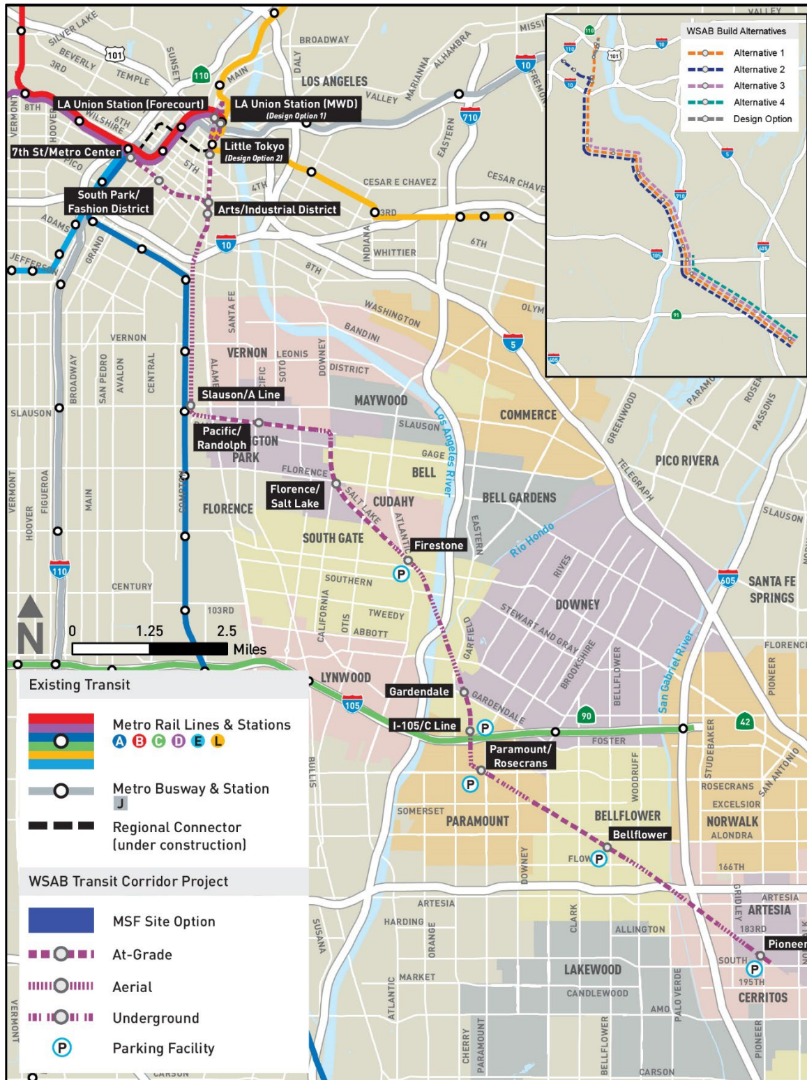
Figure 2-2. Project Alignment by Grade