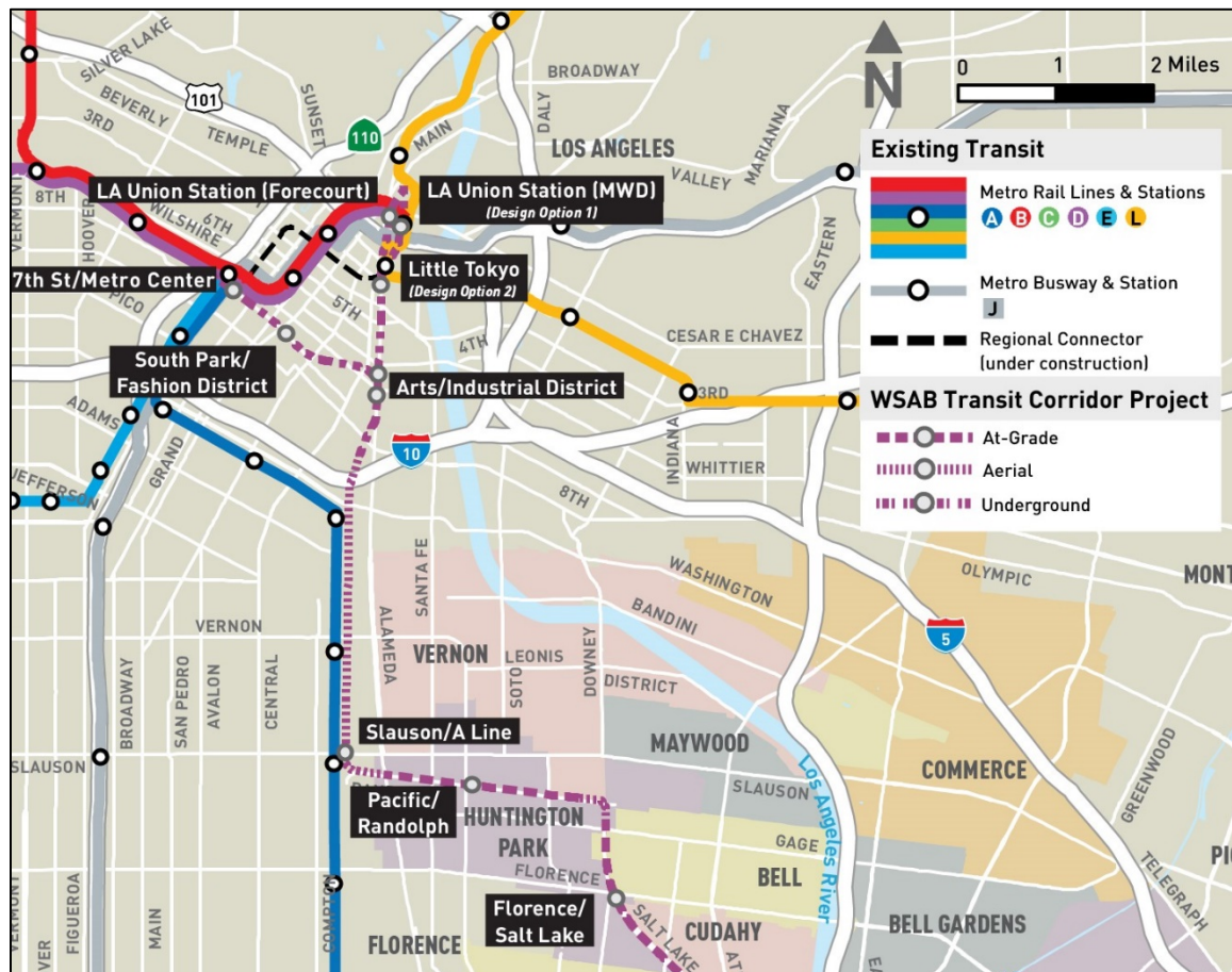
Figure 2-3. Northern Section

The Northern Section of the Project Corridor includes approximately 8 miles of Build Alternatives 1 and 2 and 3.8 miles for Alternative 3. Alternative 4 is not within the Northern Section. The Northern Section covers the geographic area from downtown Los Angeles to Florence Avenue in the City of Huntington Park and would generally traverse the Cities of Los Angeles, Vernon, Huntington Park, and Bell, and the unincorporated Florence-Firestone community of LA County (Figure 2-3). Build Alternatives 1 and 2 would traverse portions of the Wilmington Branch (between approximately Martin Luther King Jr Boulevard along Long Beach Avenue to Slauson Avenue). Build Alternatives 1, 2, and 3 would traverse portions of the La Habra Branch ROW (between Slauson Avenue along Randolph Street to Salt Lake Avenue), and San Pedro Subdivision ROW (between Randolph Street to approximately Paramount Boulevard) along the Northern Section.