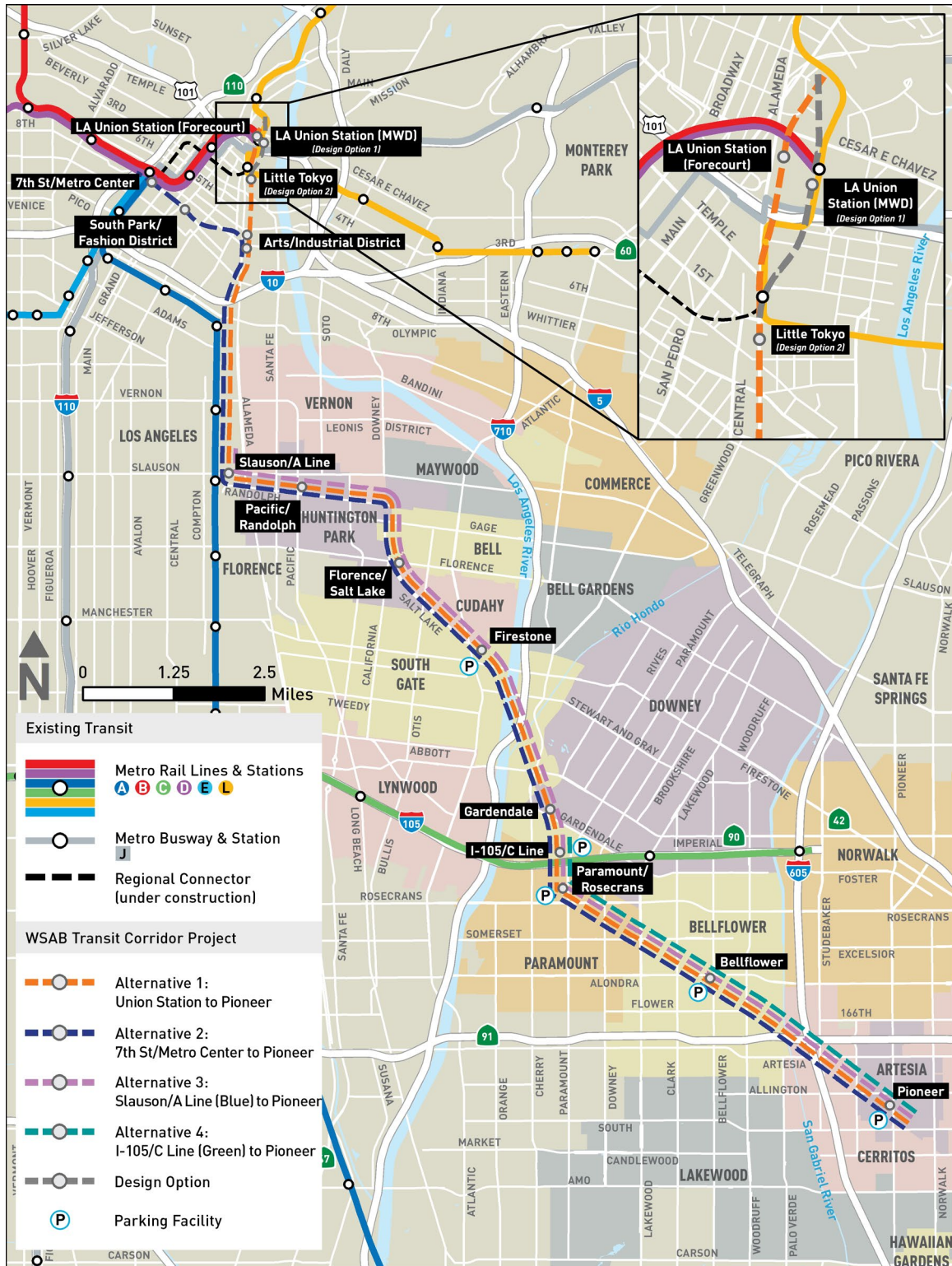
Figure S-2. WSAB Transit Corridor Build Alternatives