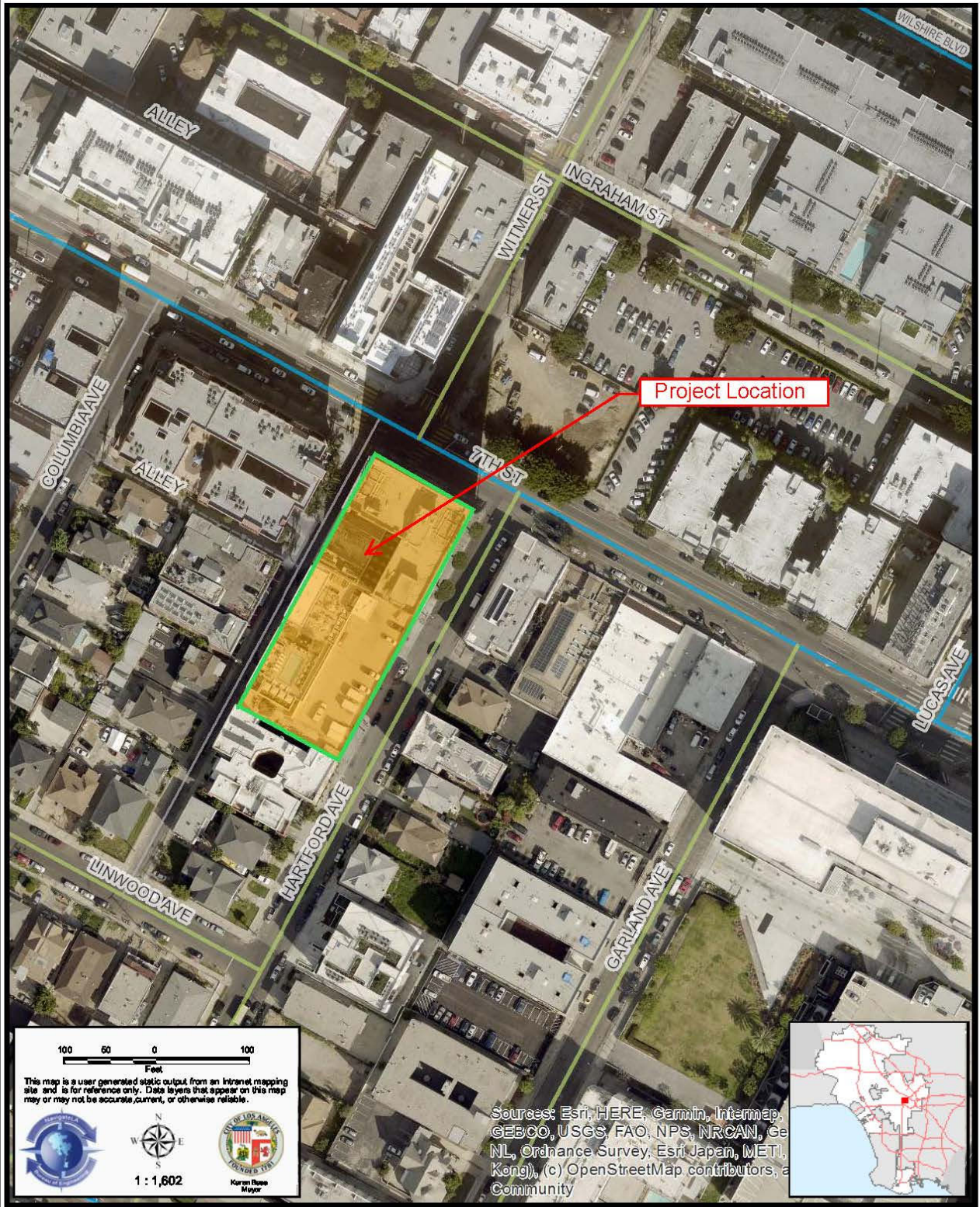
Figure 1: Project Location