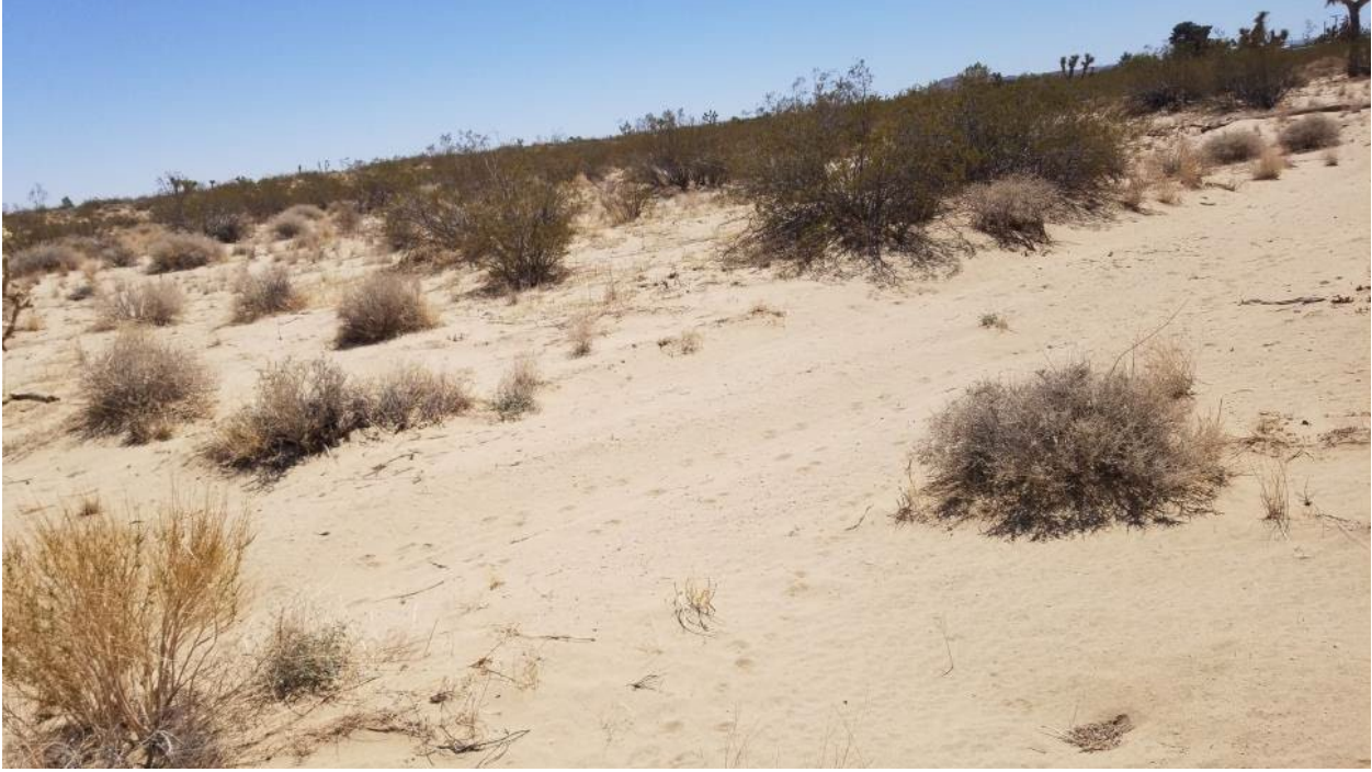
Figure 4 Project Site View East