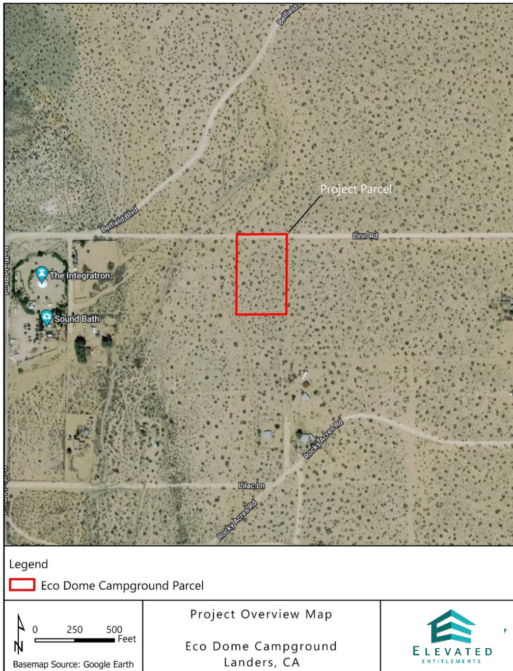
Figure 1 Project Site

The Eco Dome Project is proposed at 57899 Linn Road in the County of San Bernardino. The 2.5-acre parcel is zoned Homestead Valley/Rural Living (HV/RL) and designated RL on the Countywide Land Use Plan. The Project site is generally flat with slopes less than 5%. The site encompasses six Joshua Trees and one Yucca. There are no known animal habitats, or historical features. There is a defined watercourse west of the Project site.