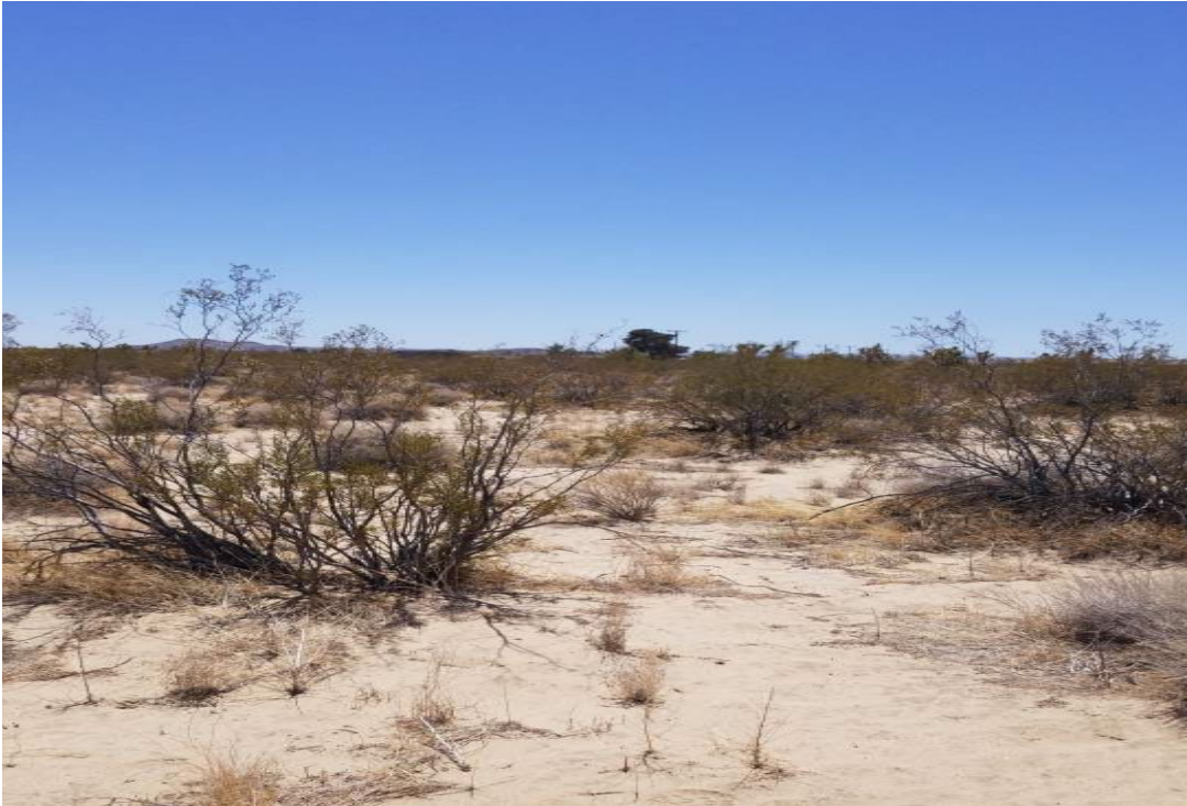
Figure 5 Project Site View South