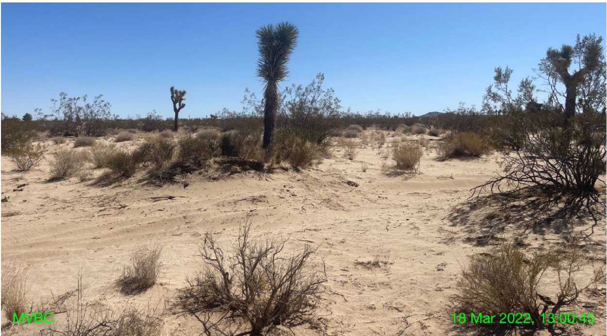
Figure 3 Project Site View Northwest corner of Subject Parcel looking southeast