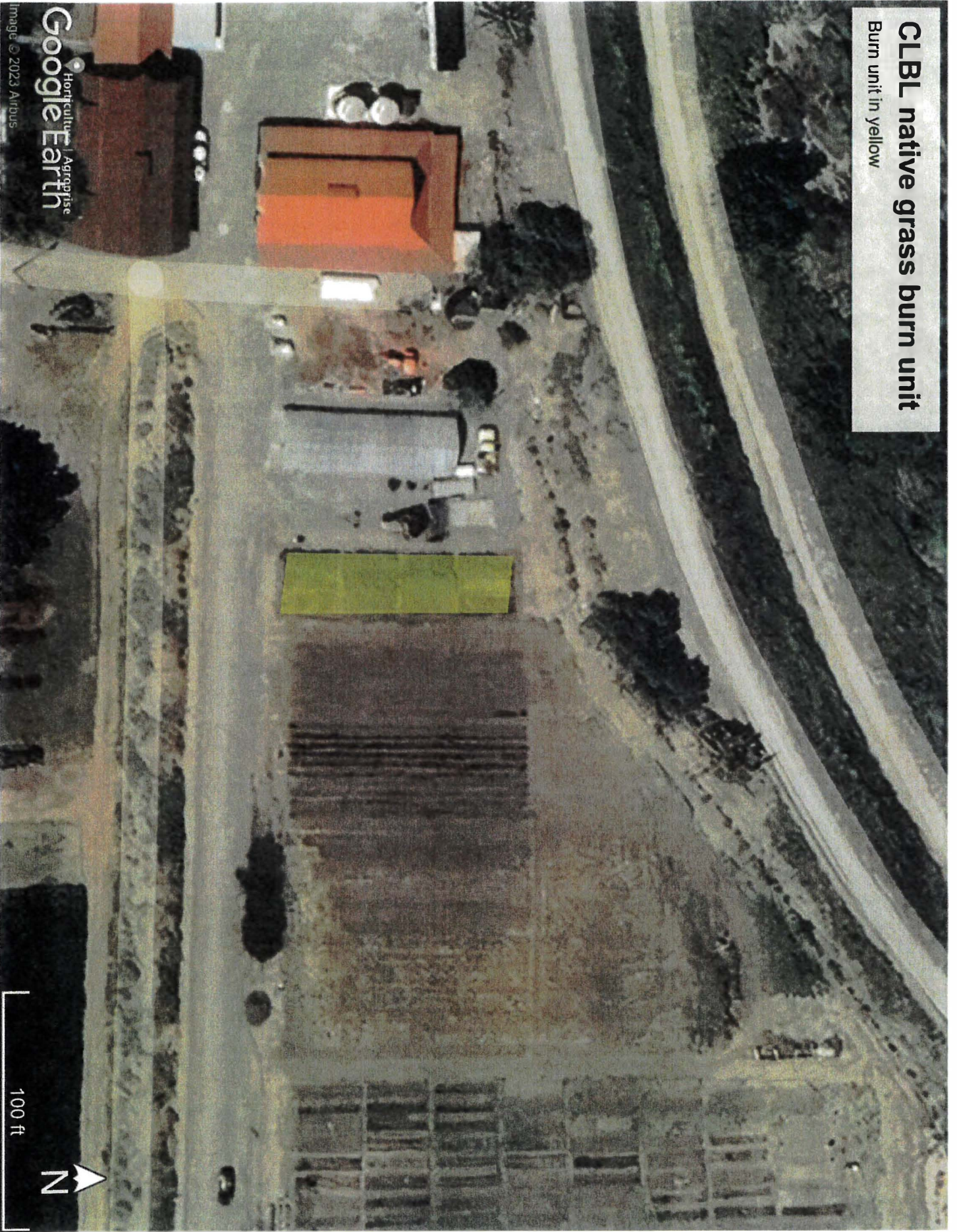
CLBL native grass burn unit Burn unit in yellow

Google Earth Horticulture | Agronomy Image © 2023 Airbus