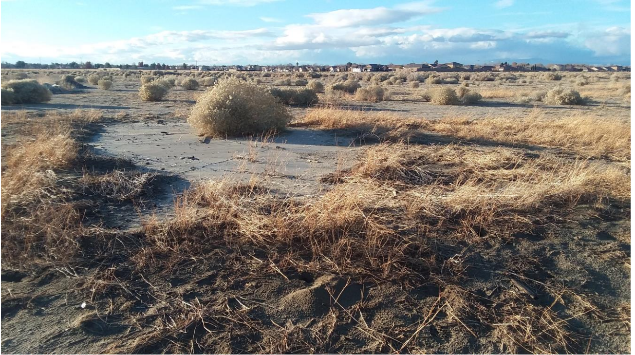
Figure 4 R-1, View to the Northwest