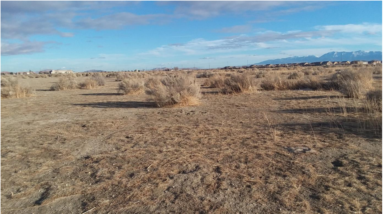
Figure 3 Project Area, View to the Southeast