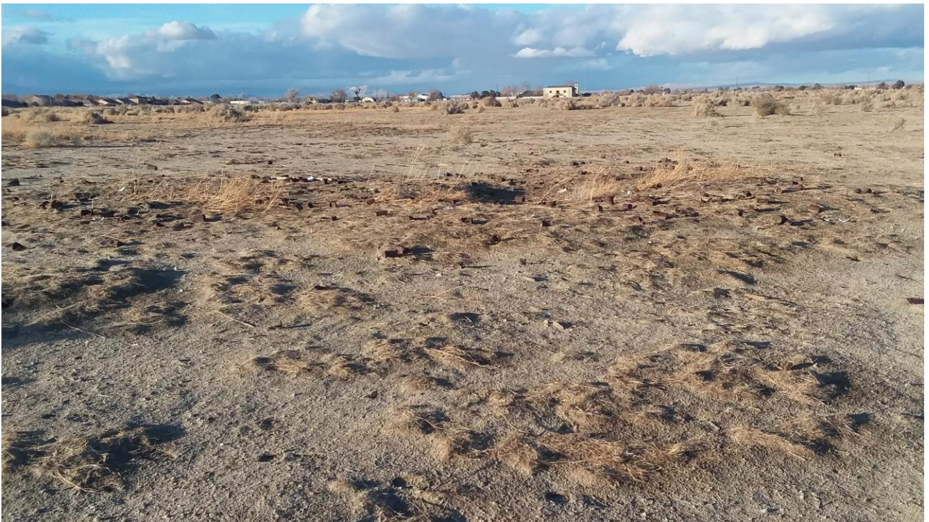
Figure 5 R-1, View to the Northwest, showing looter's pits