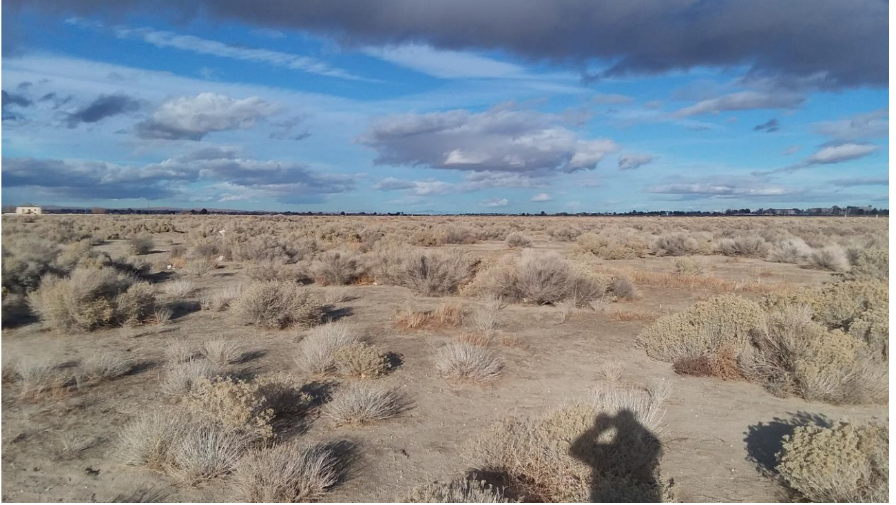
Figure 2 Project Area, View to the North