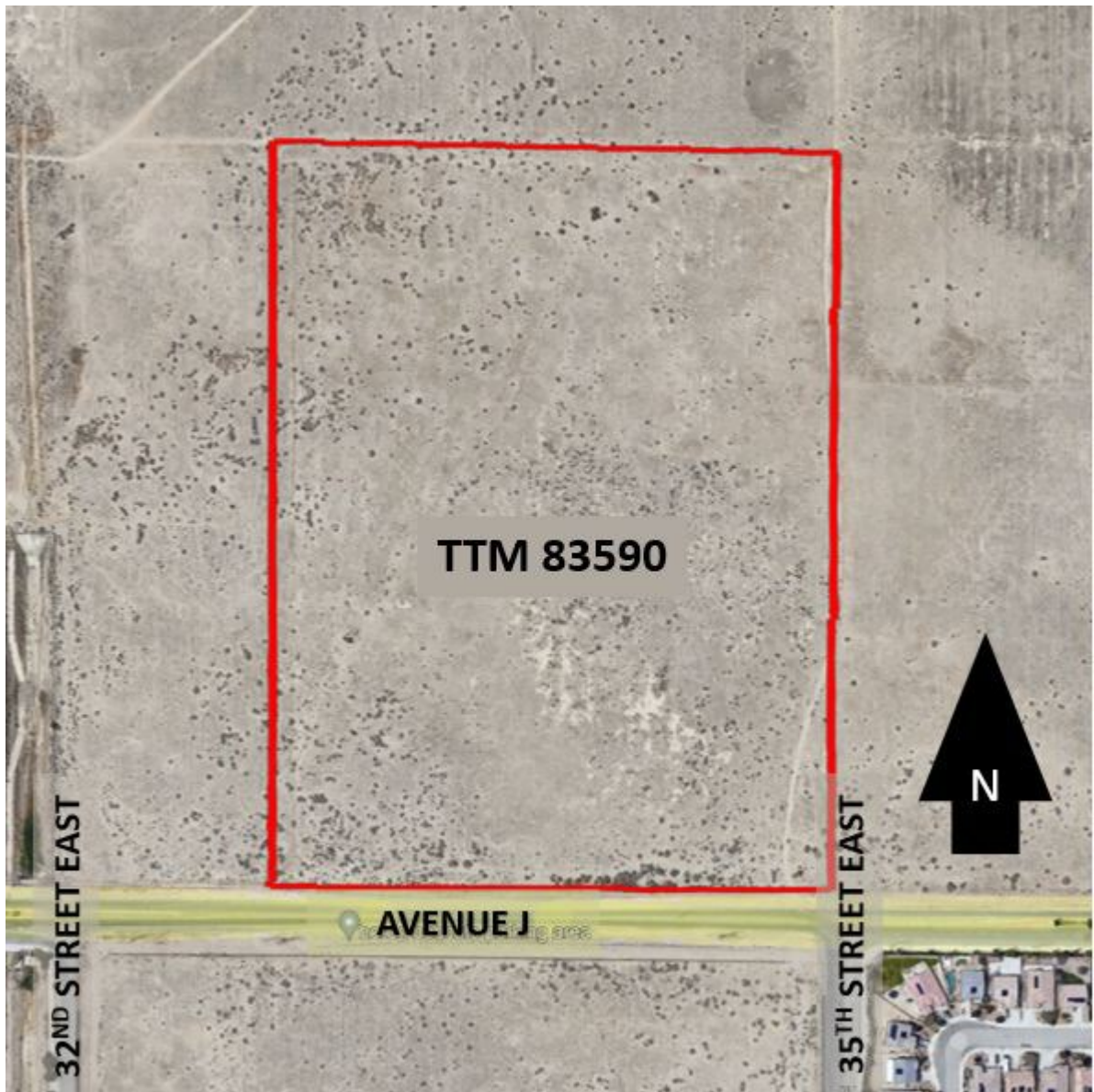
Figure 1, Project Location Map