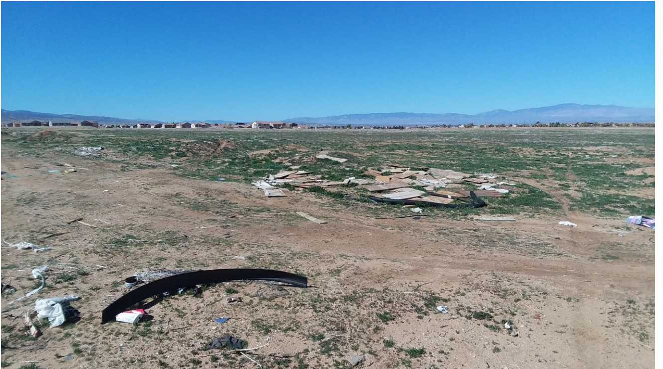
Figure 3 Project Area, View to the Northwest