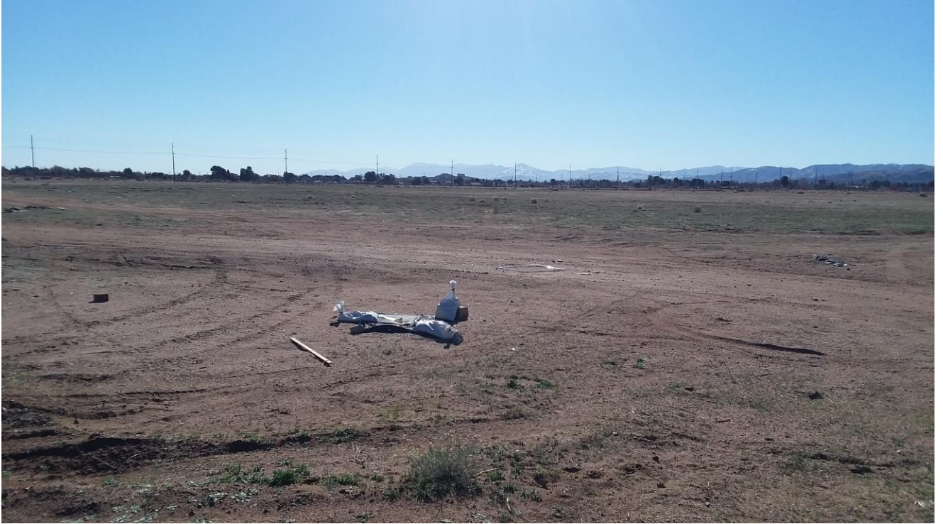
Figure 2 Project Area, View to the Southeast