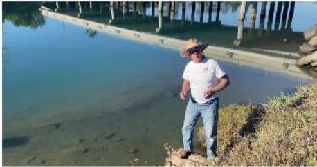
Bat Rays, Fish and the flushing of an outgoing tide.

T-1 | This plan lacks historical information and is unacceptable because it permanently incorporates historical Environmental Injustice of the past 40 years practiced by the County of San Diego on the homeowners and ranchers of the South Bay Community.