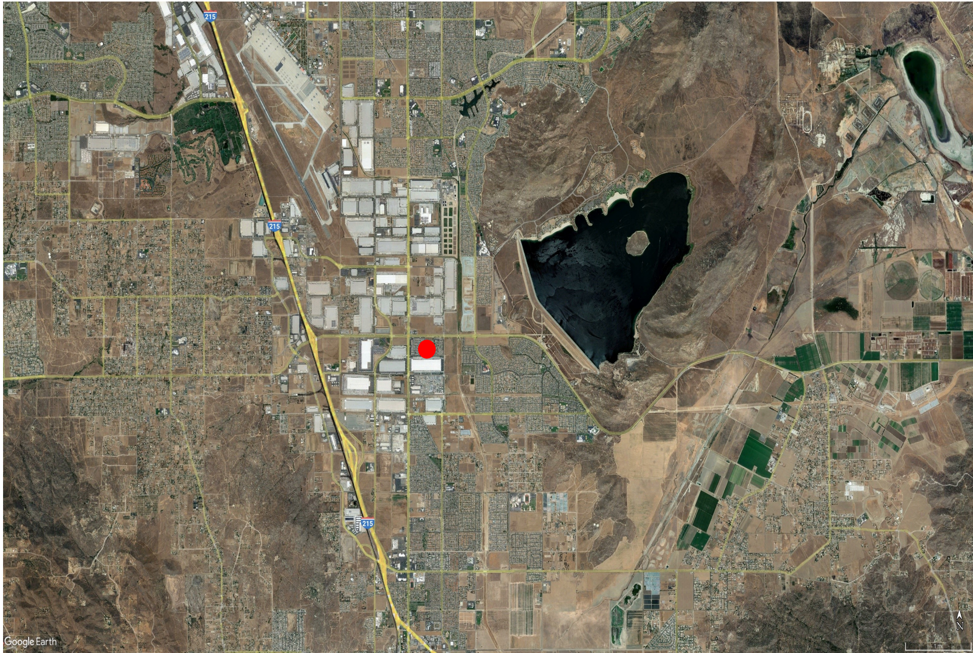
Figure 1—Regional Map