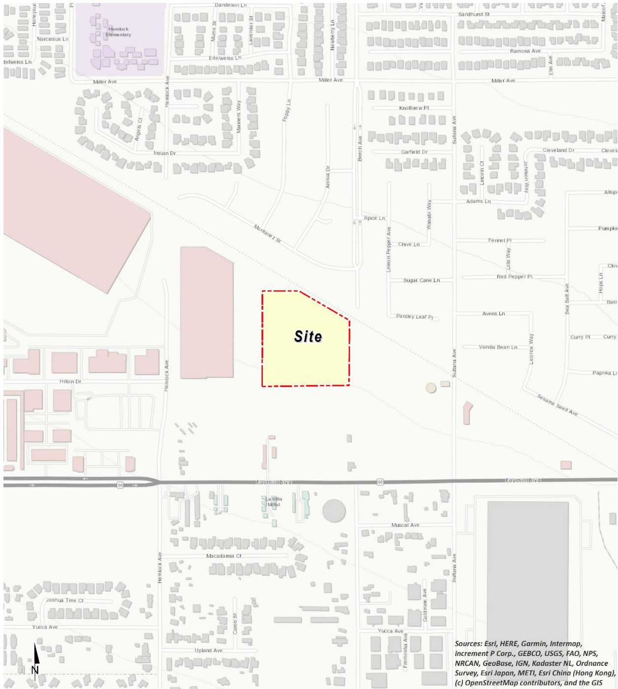
EXHIBIT 1-A: LOCATION MAP