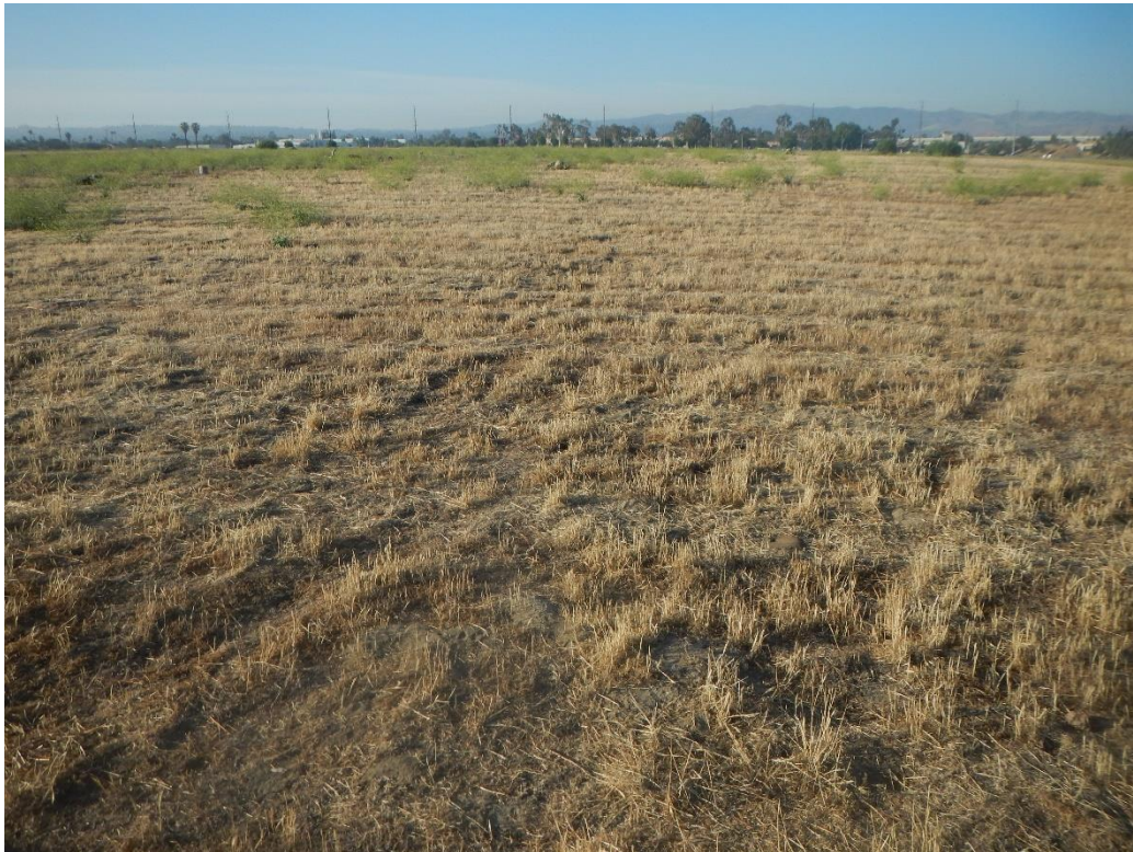
Photograph 4: Standing in the northwest corner of the survey area, facing south overlooking disturbed habitat.