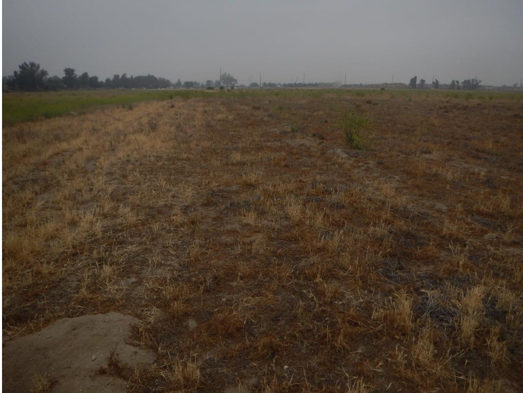
Photograph 3: Standing in the southwest corner of the survey area, facing north overlooking disturbed habitat.