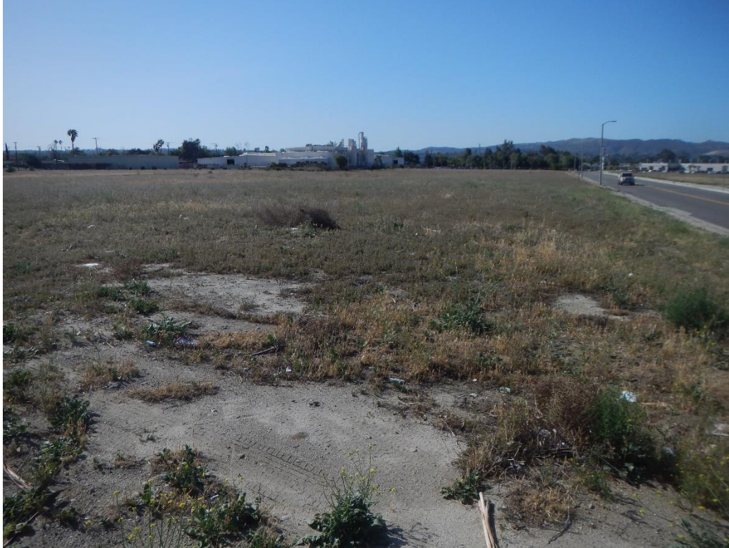
Photograph 7: Standing in the southeast corner of the survey area, facing south overlooking disturbed habitat.