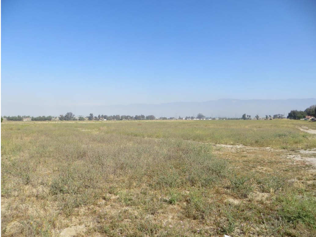
Photograph 1: Standing in the southeast corner of the project site, facing north overlooking disturbed habitat.