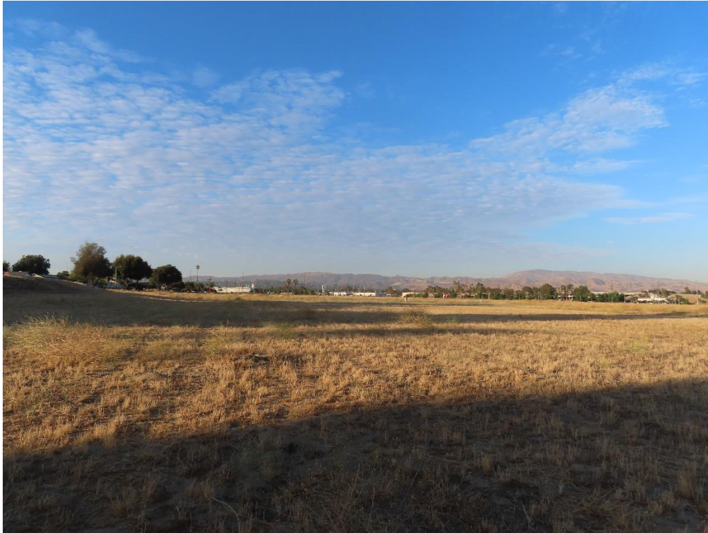
Photograph 5: Standing along the northern edge of the survey area, facing south overlooking disturbed habitat.