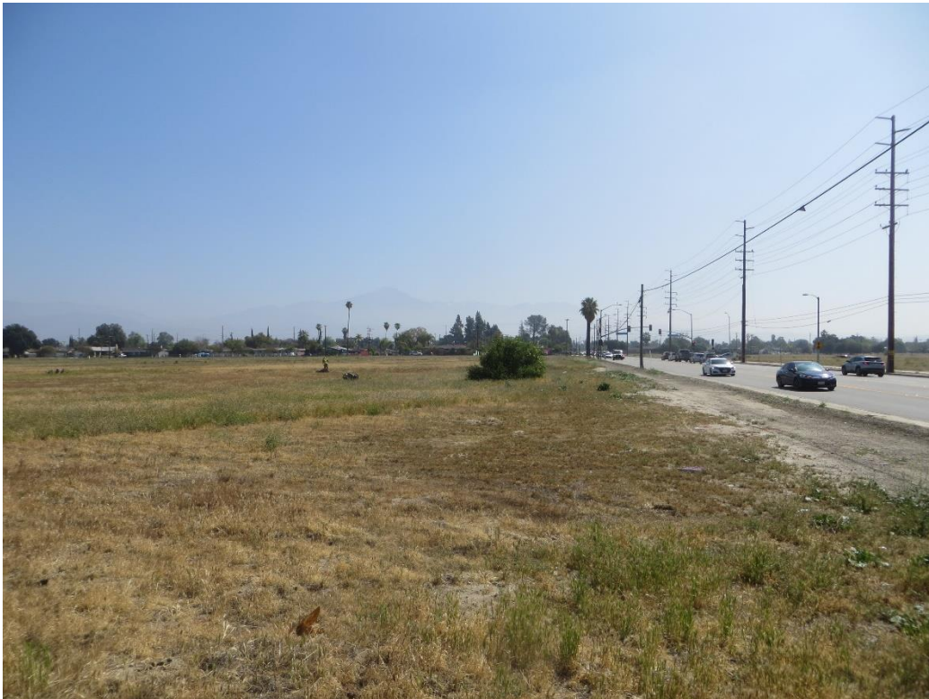
Photograph 2: Standing at southwest corner of project boundary, facing east overlooking disturbed habitat.