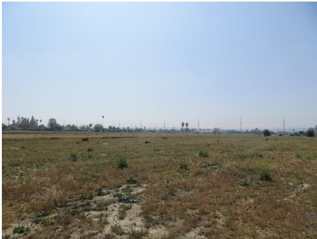
Photograph 6: Standing in the northwest corner of the project site facing southeast overlooking disturbed habitat.