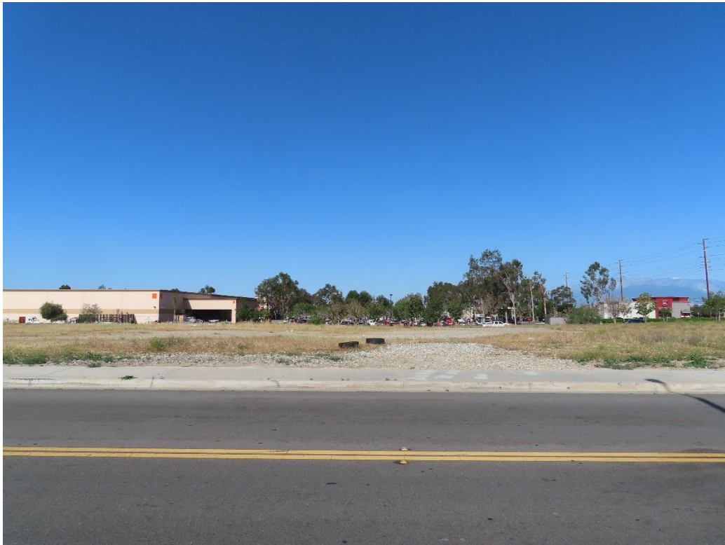
Photograph 8: Standing at New York Street, facing west overlooking disturbed habitat within the 500-foot buffer.